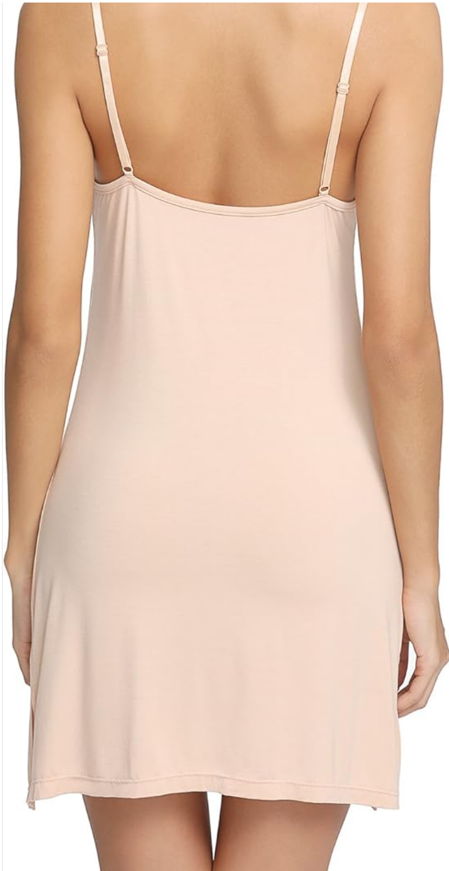
Image 3.2: Back view of the slip, showing the adjustable spaghetti straps.