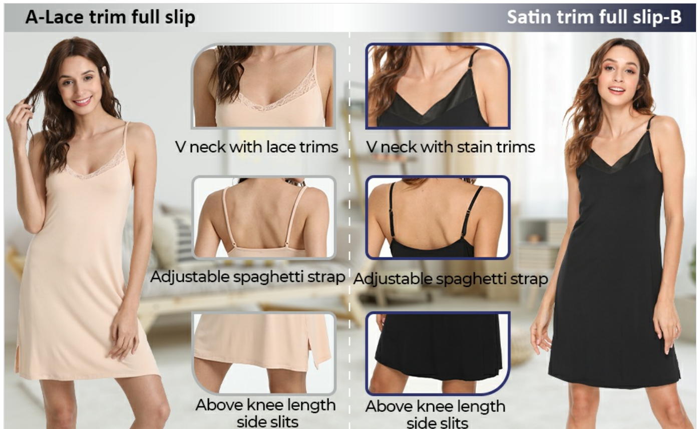
Image 7.4: A comparison illustrating the differences between Style A (Lace trim) and Style B (Satin trim) full slips, including V-neck, adjustable straps, and side slits.