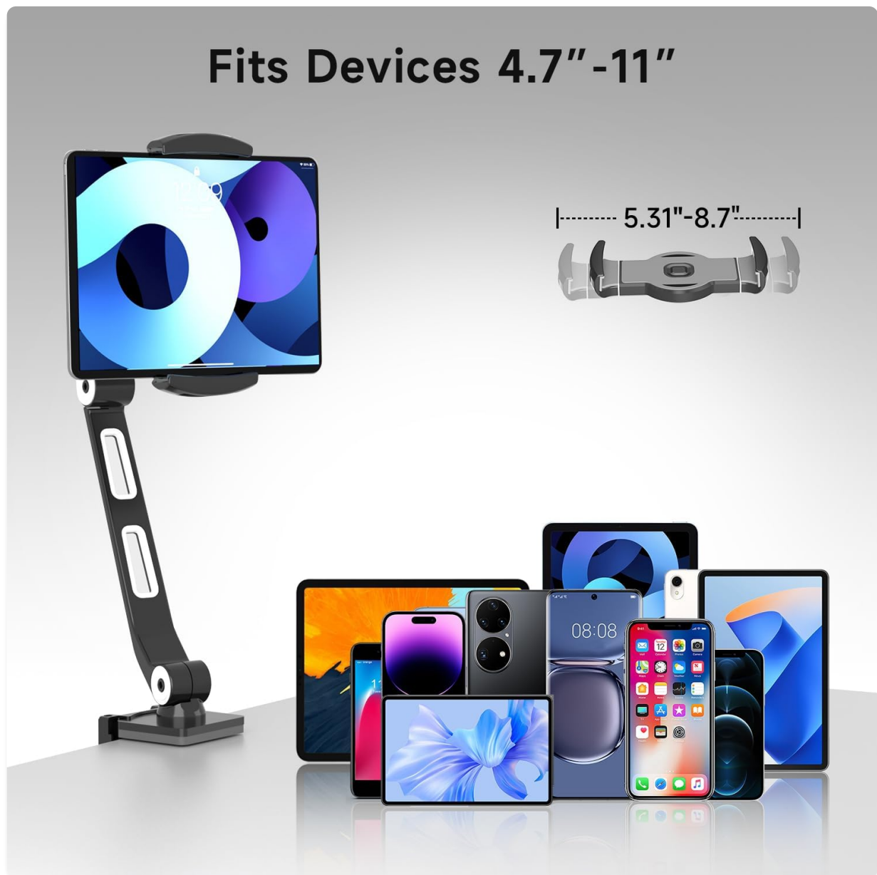
Image: The stand is compatible with a wide range of devices, from 4.7-inch smartphones to 11-inch tablets, as shown with various models.

Image: This diagram illustrates the full range of motion, including 360° rotation at the device holder and 180° swivel at the arm joints, allowing for versatile positioning.