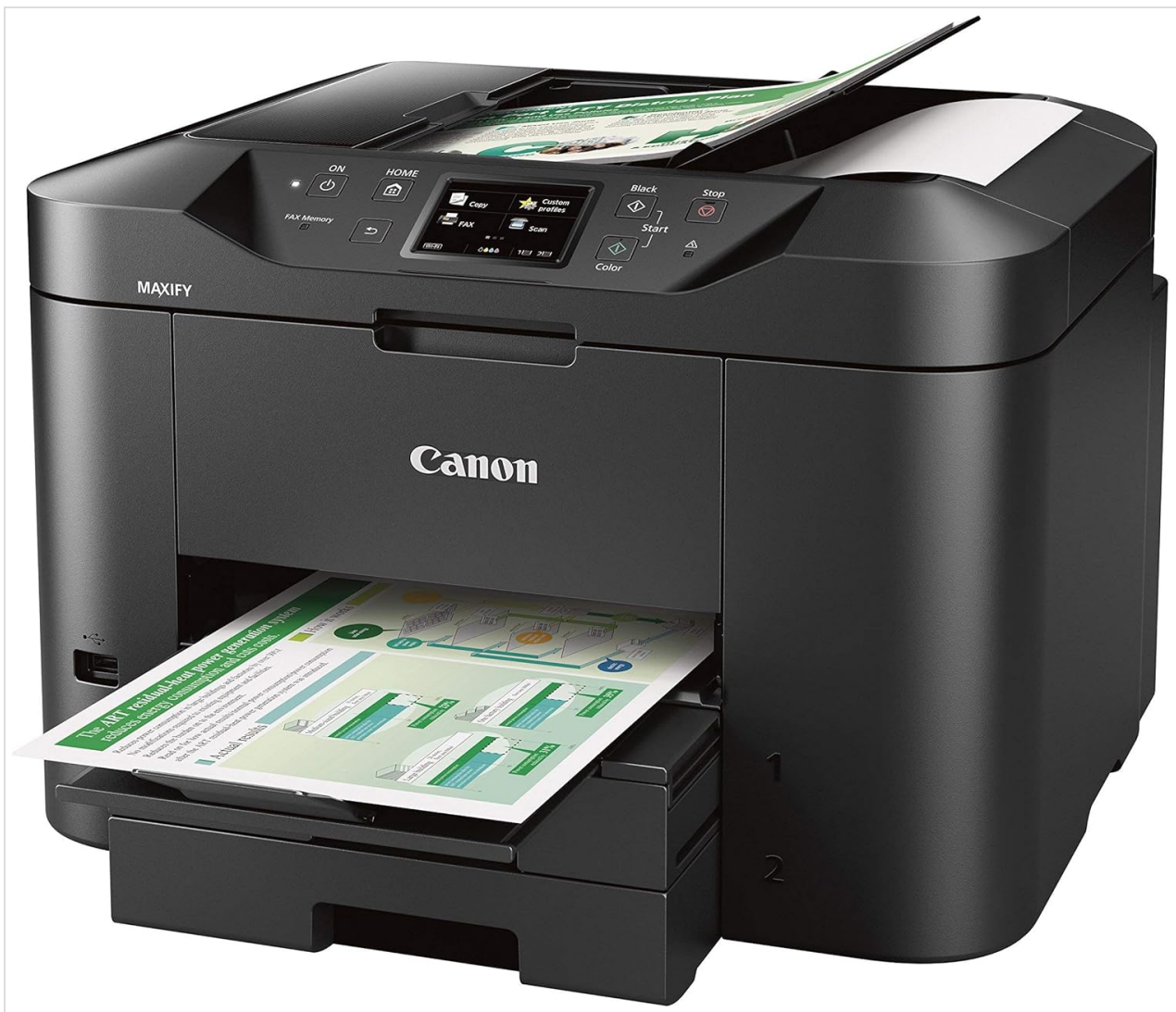
Image: Side view of the Canon MAXIFY MB2720 printer with both paper trays extended, showing paper loaded.