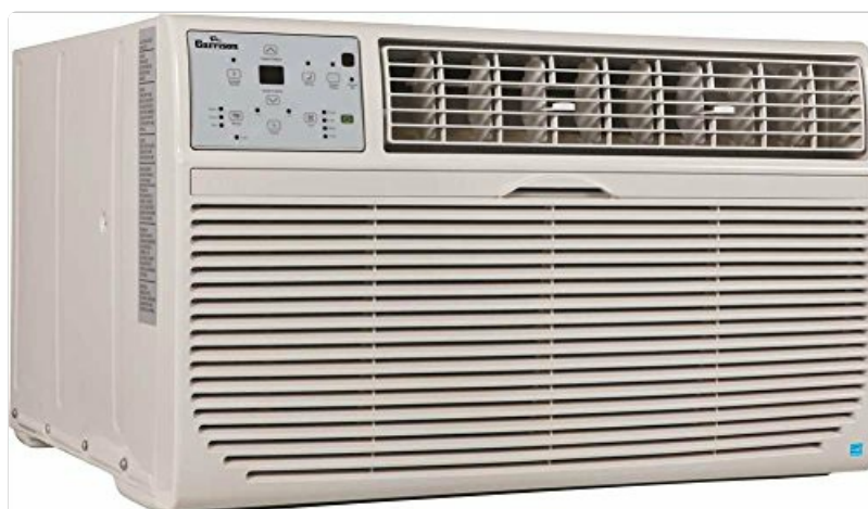
Image: Front view of the Garrison 8,000 BTU Through-The-Wall Air Conditioner. The unit is light-colored with a control panel on the top left and air vents on the top right and across the lower front.