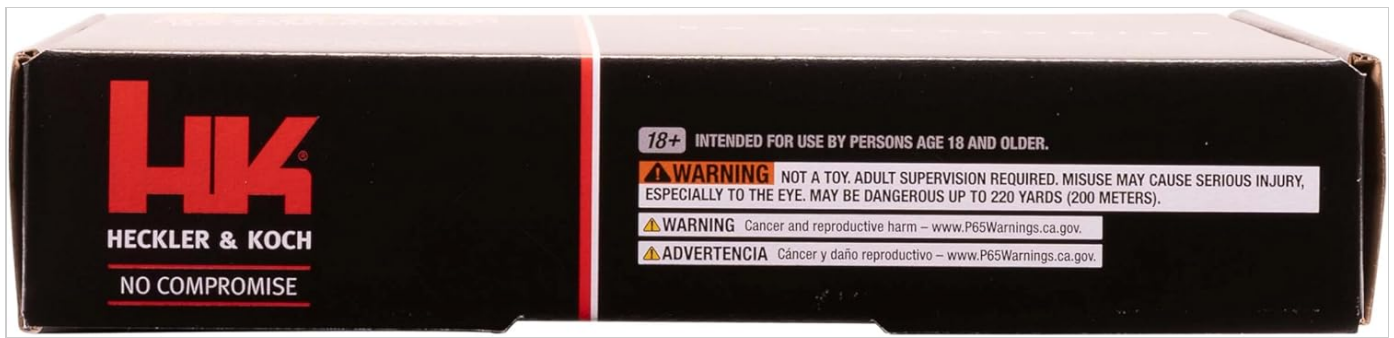
Image: Warning label on the product packaging, detailing safety precautions and age restrictions.