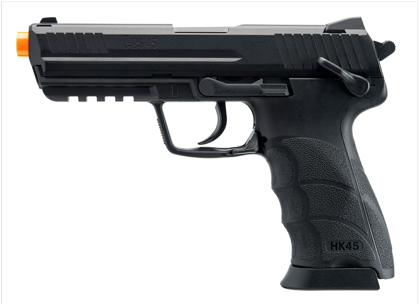
Image: The Umarex Elite Force HK45 CO2 Airsoft Pistol, showcasing its design and features.