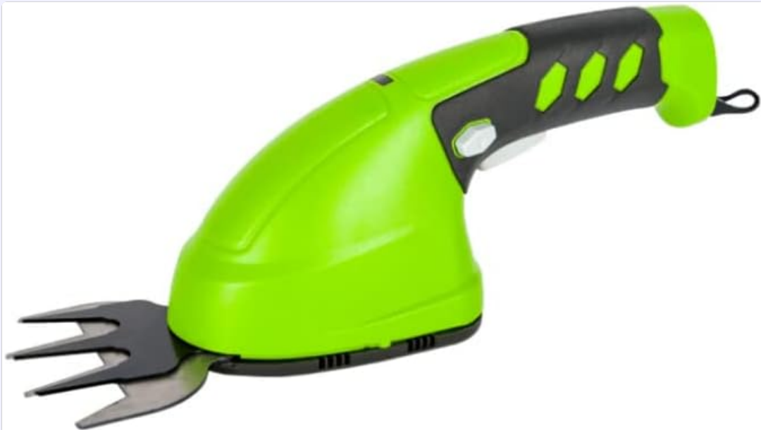
Figure 4.1: The safety lock button and trigger mechanism on the tool handle.