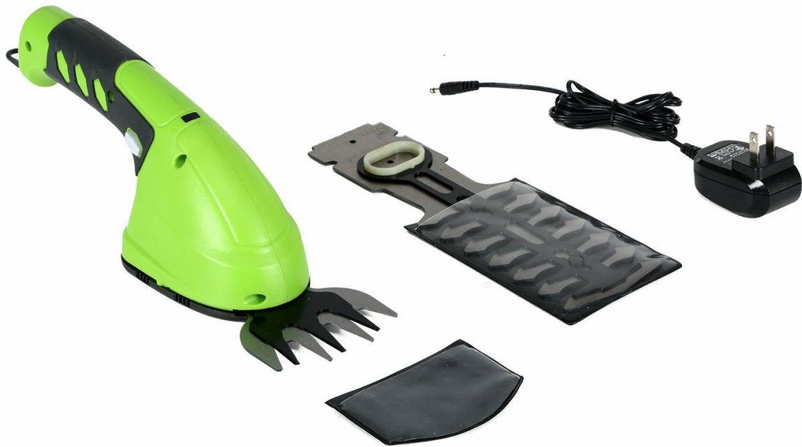
Figure 2.1: Greenworks 7.2V Cordless 2-in-1 Shear Shrubby with shear blade attached.