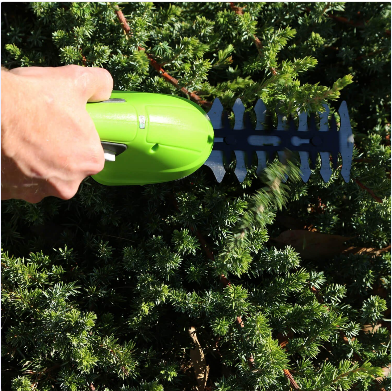
Figure 4.3: The hedger blade effectively trimming small shrubs.