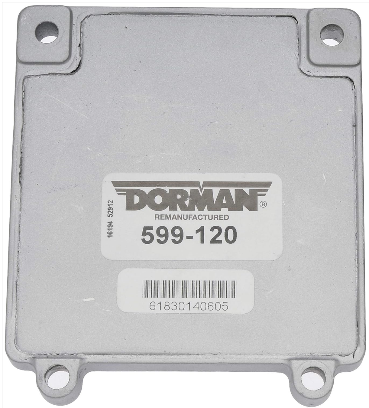
Image: The Dorman 599-120 Transmission Control Module, displaying the Dorman branding and model number on its casing.