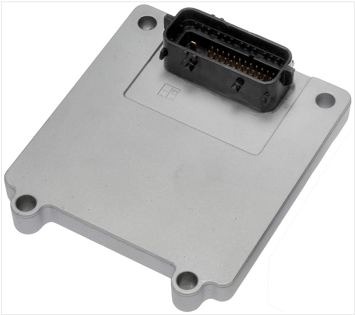
Image: The Dorman 599-120 Remanufactured Transmission Control Module, showing its compact design and electrical connector.