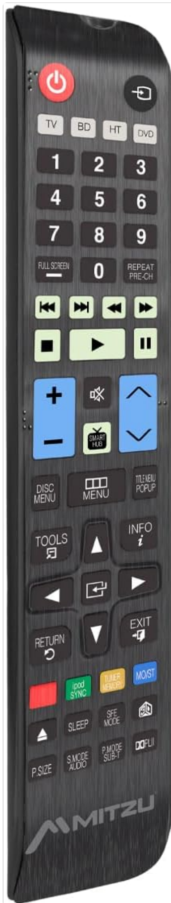
Figure 1: Mitzu MRC-UNI4 Universal Remote Control, front view showing all buttons.