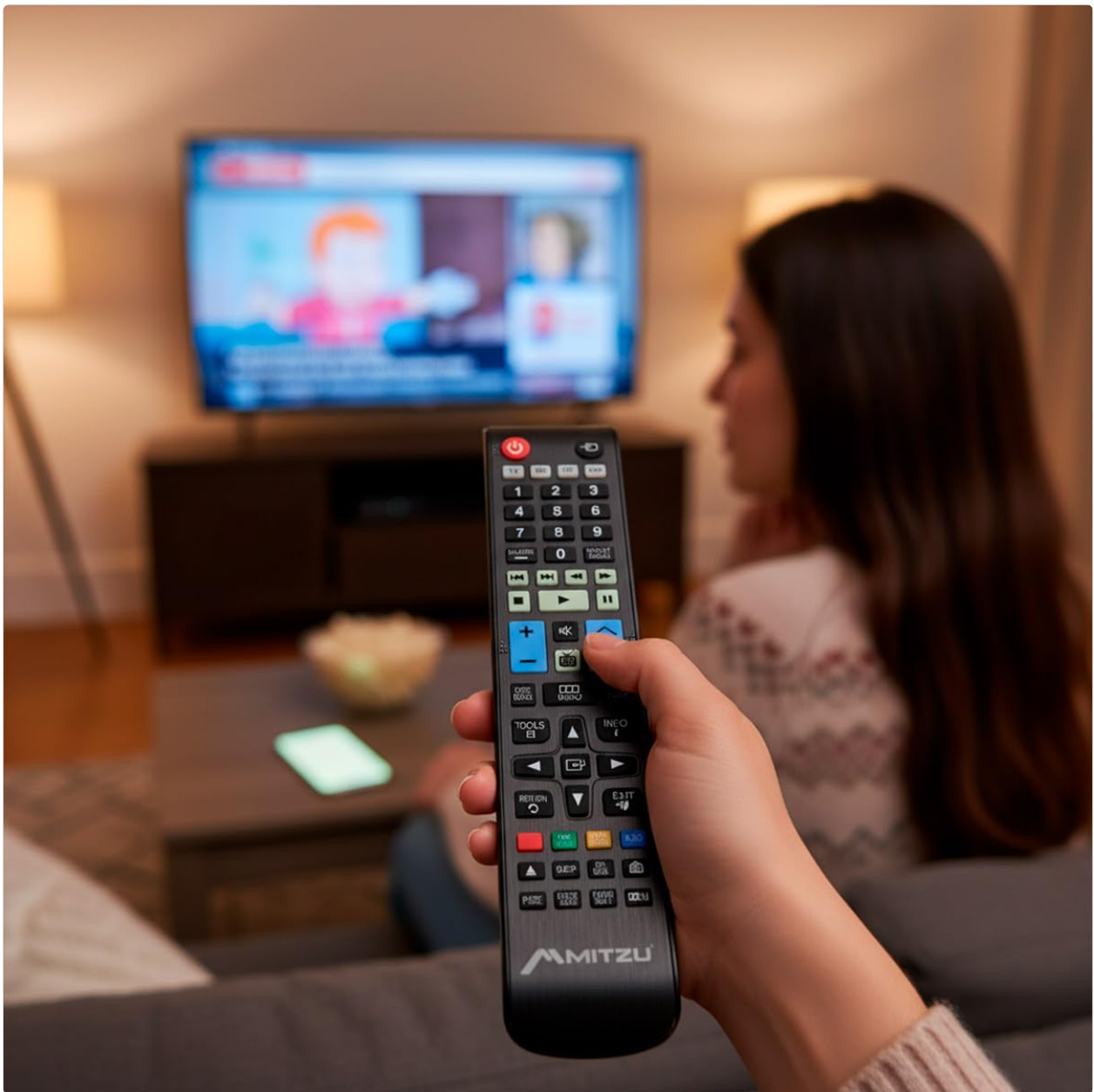
Figure 2: The Mitsu MRC-UNI4 remote control in use, demonstrating its ergonomic design.