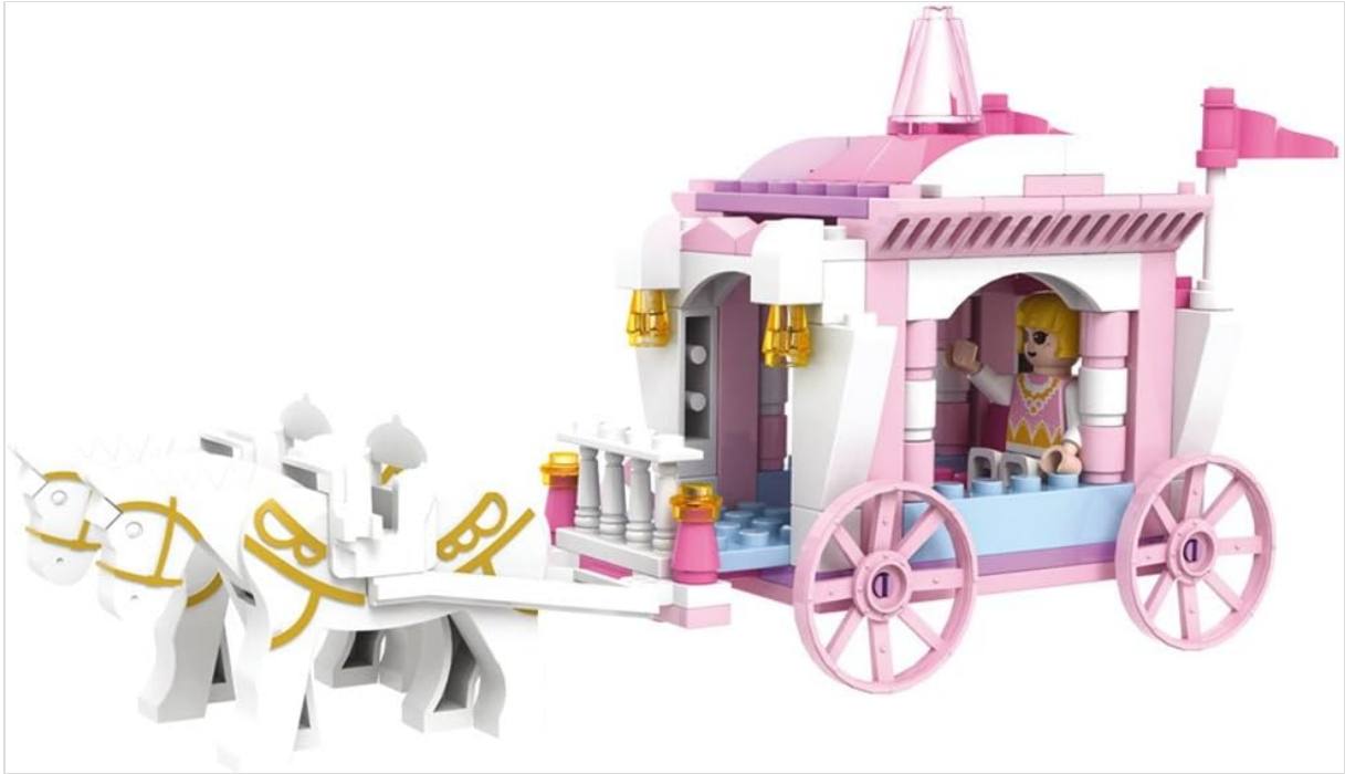
Figure 4.1: Side view of the assembled princess carriage, showing the entrance and interior.