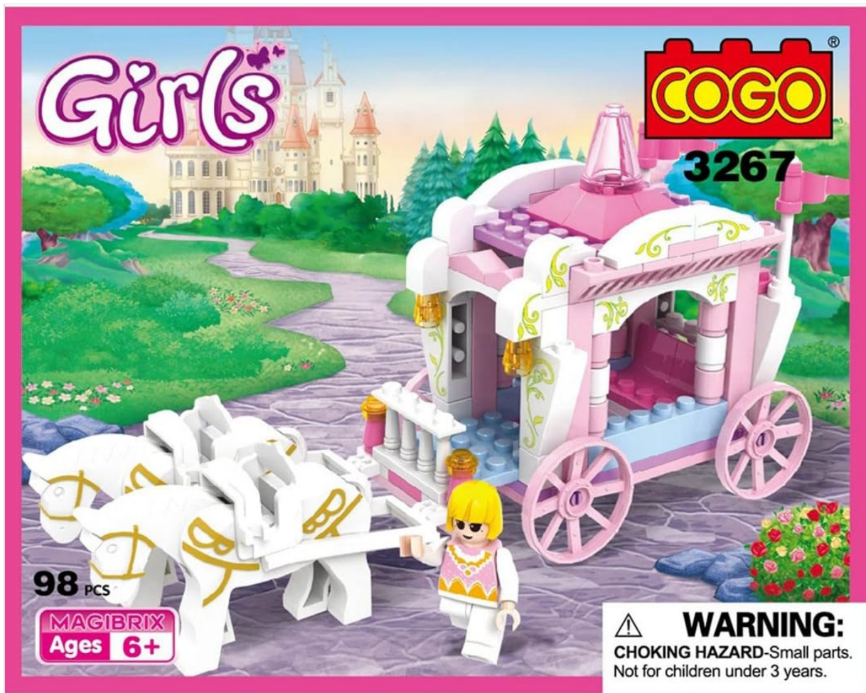
Figure 3.2: Front view of the product box, highlighting the COGO brand, model 3267, and 98 pieces.