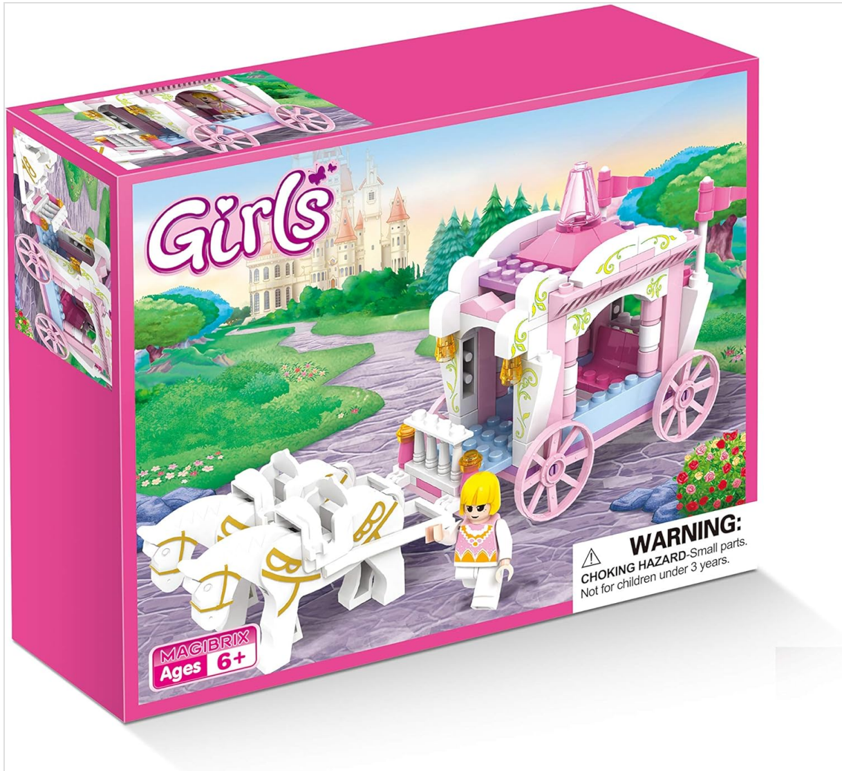
Figure 3.1: Product packaging showing the COGO Princess Carriage Building Set.