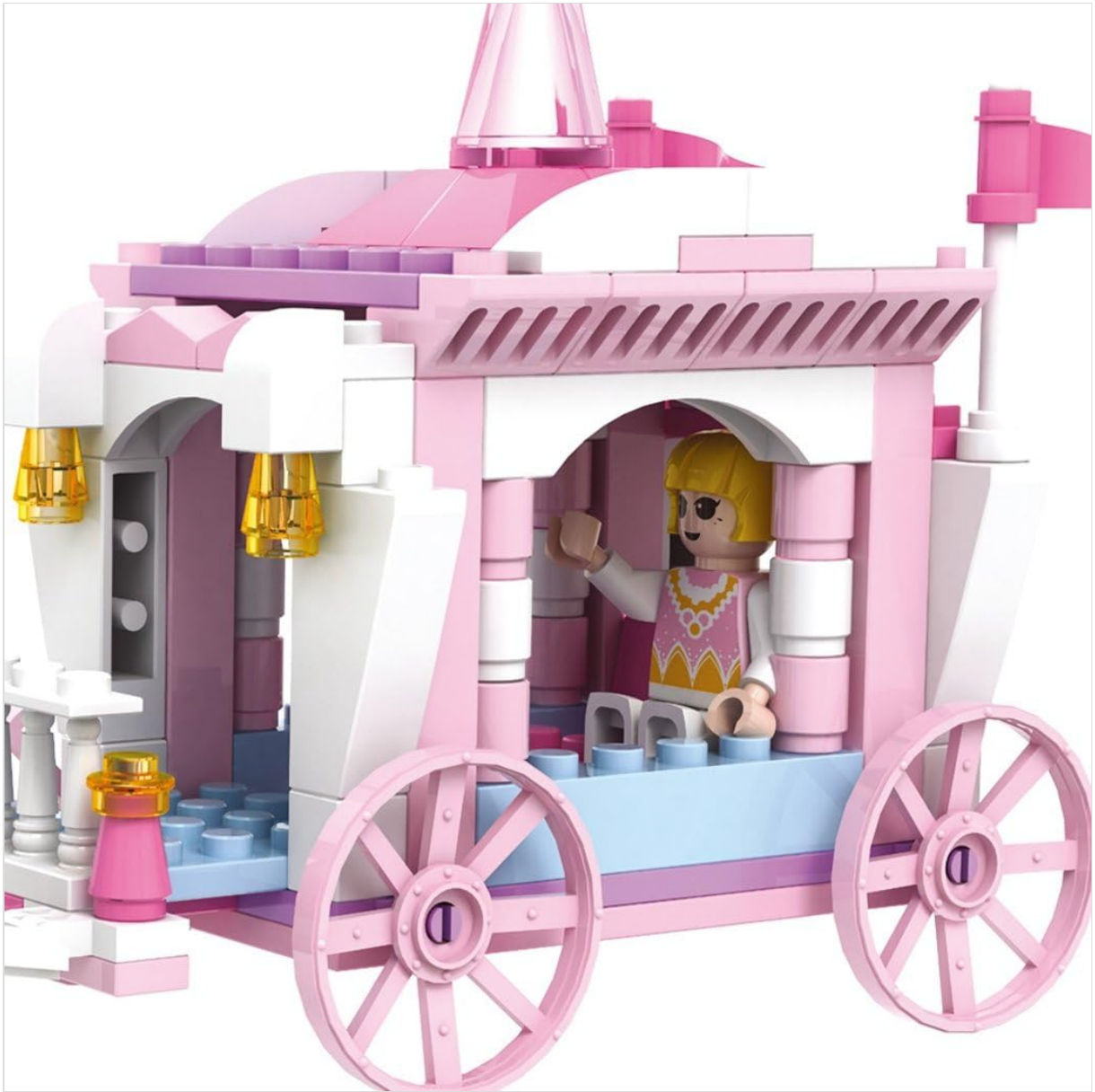
Figure 4.2: Detailed view of the carriage, highlighting its decorative elements like the pink roof and golden lanterns.