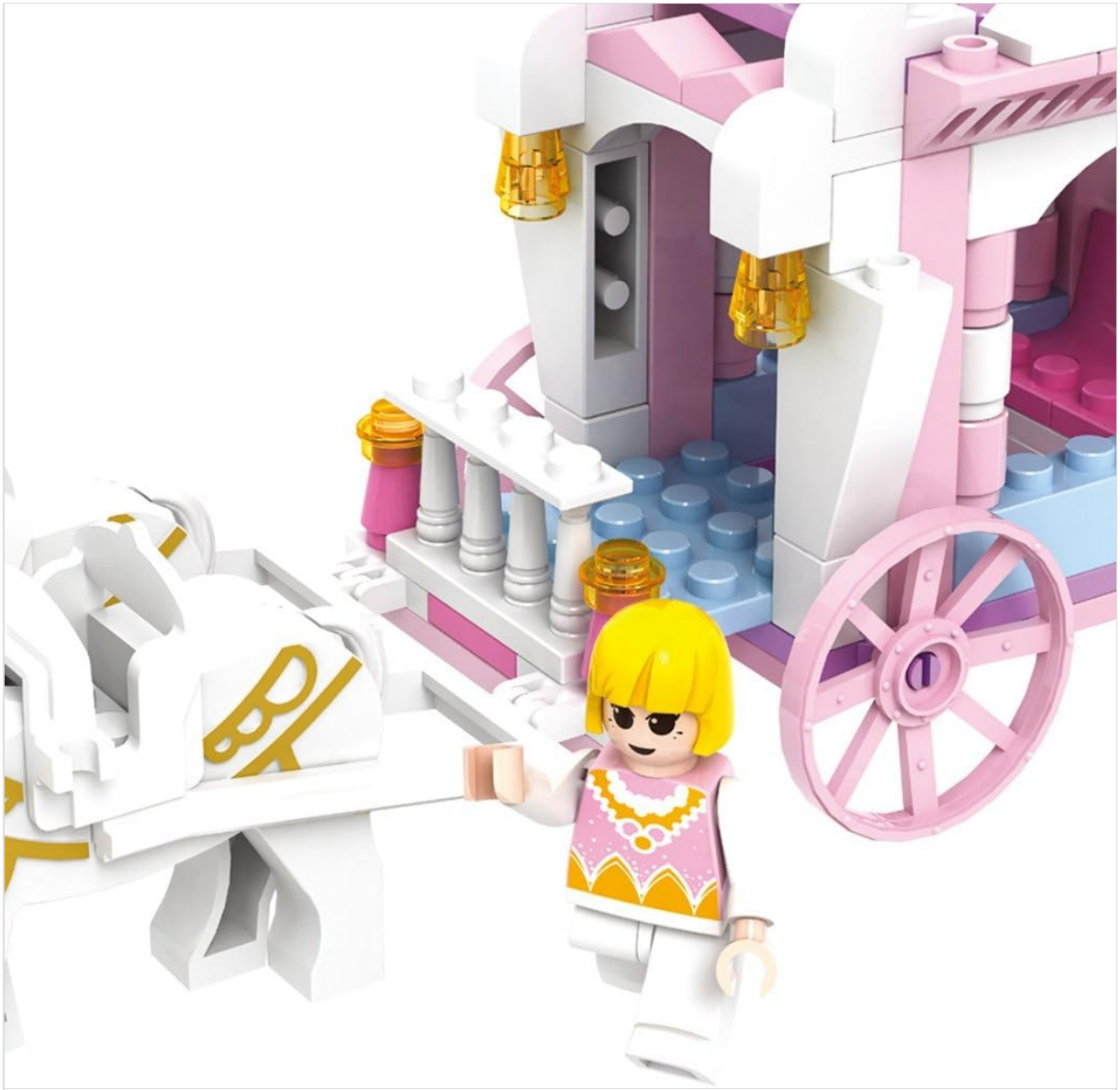
Figure 4.3: Close-up of the doll figure standing next to the front of the carriage and horses.