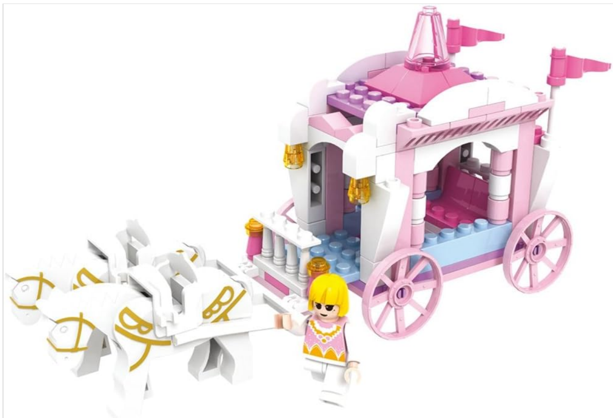
Figure 3.3: The fully assembled COGO Princess Carriage with two white horses and a doll figure.