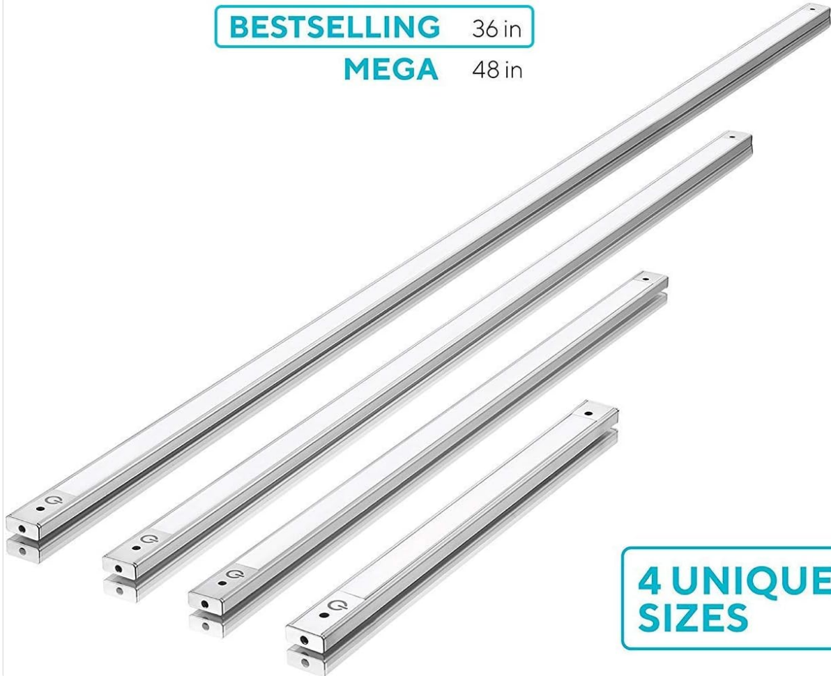
Image: Different available sizes of the phonar LED light bars.