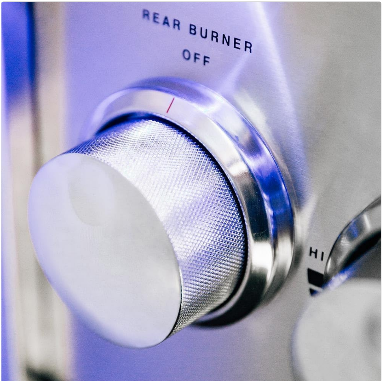
Image: A close-up of a Summerset Alturi Series control knob, showing the 'OFF' and 'HI' settings, with integrated blue LED lighting.