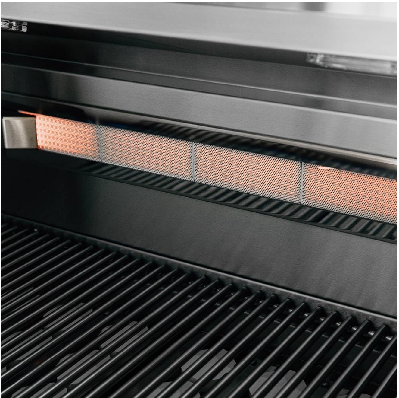
Image: The rear infrared burner, designed for rotisserie cooking, glowing red when active.