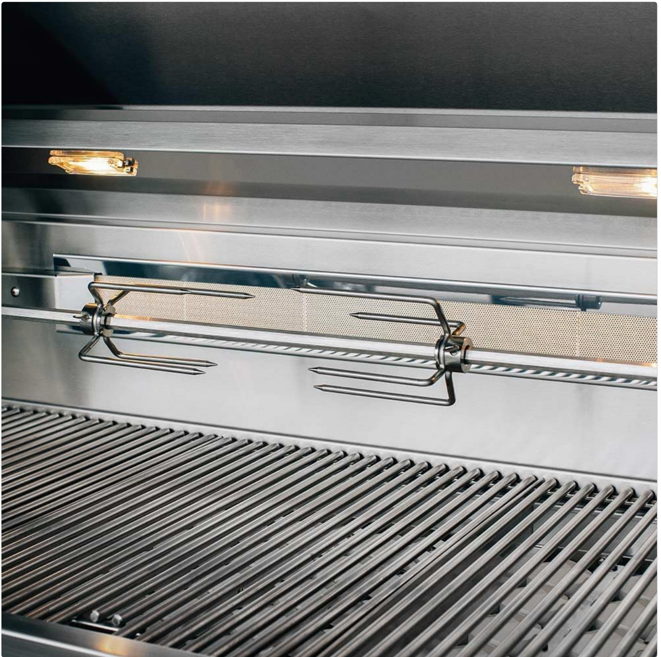
Image: The rotisserie spit and forks installed in the grill, ready for use with the rear infrared burner.