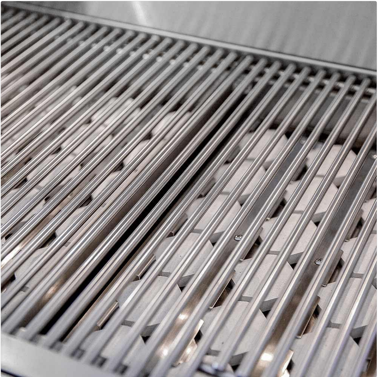
Image: Stainless steel cooking grates, providing a durable and easy-to-clean surface for grilling.