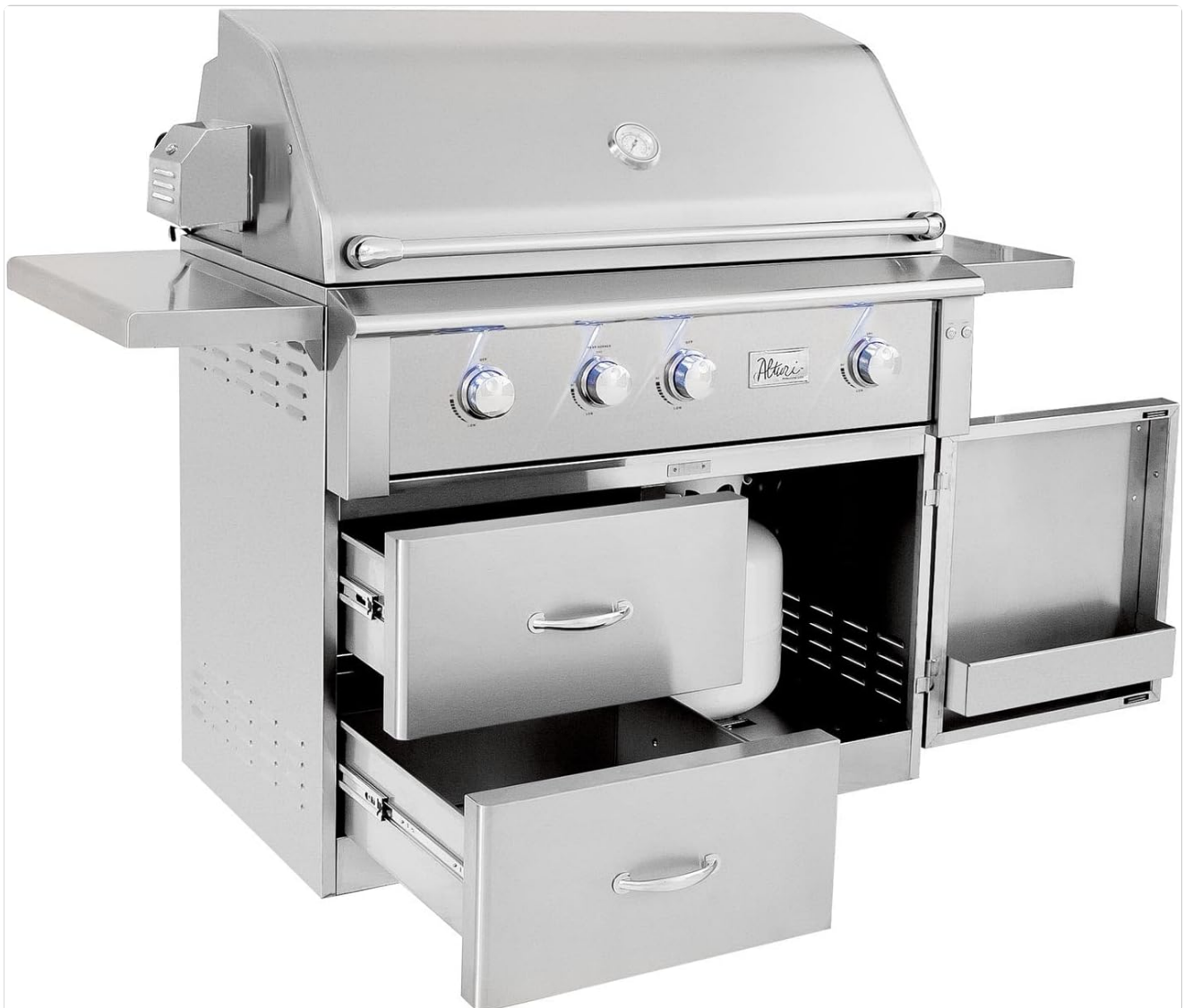
Image: The Summerset Alturi Series 42-inch natural gas grill fully assembled on its cart, showcasing its stainless steel construction and storage drawers.

Carefully lift the grill head and place it onto the assembled cart, aligning it with the mounting points. Secure the grill head to the cart using the provided hardware.