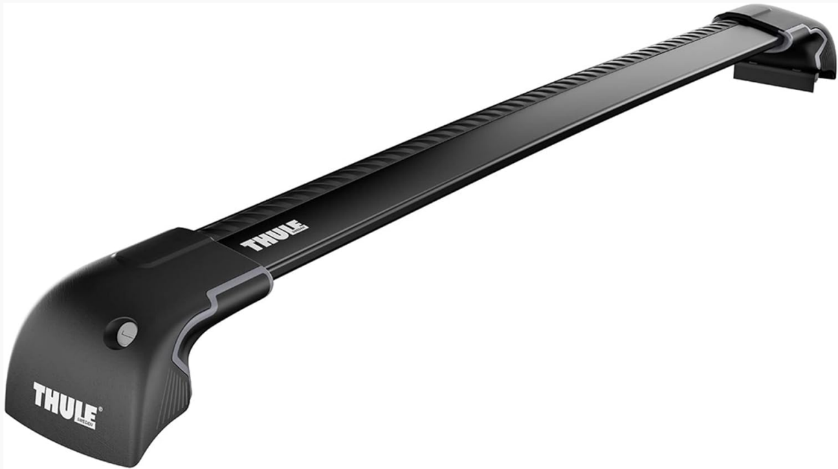
Figure 1: Thule AeroBlade Edge Flush Mount Rack (1 Bar) Black Small.

Note: A vehicle-specific fit kit and Thule One-Key locks are sold separately and are required for complete installation and security.