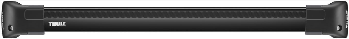
Figure 2: Top view of the AeroBlade Edge bar, highlighting the T-track for accessory attachment.