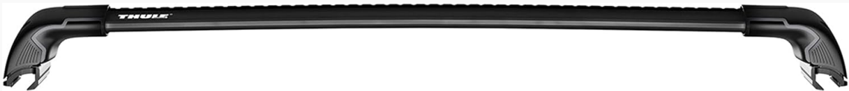
Figure 3: Side profile of the AeroBlade Edge bar, showcasing its aerodynamic design.