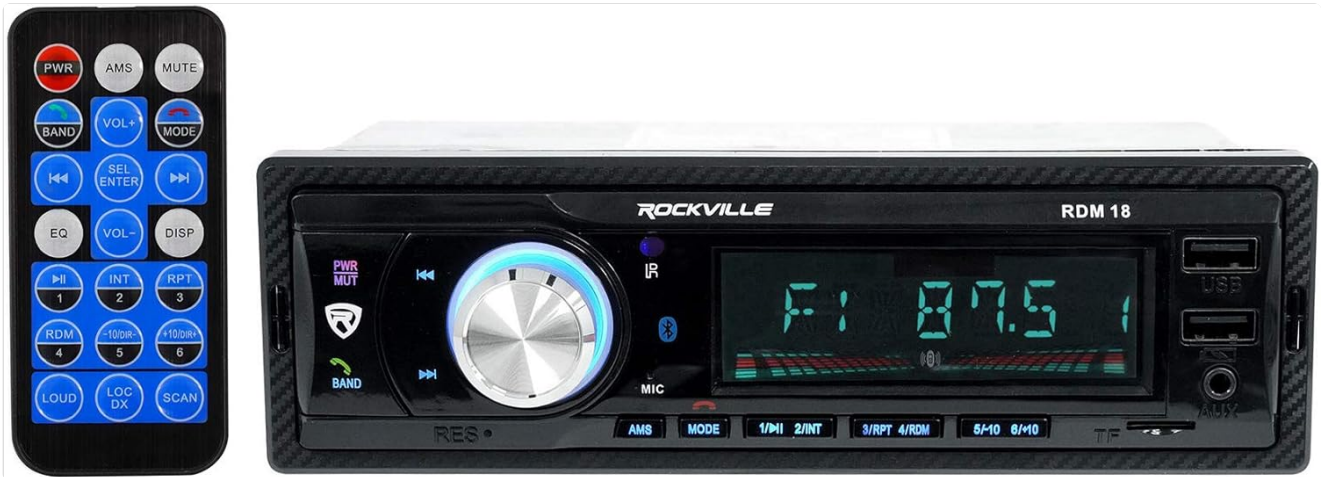
Image: Front view of the Rockville RDM18 digital media receiver, showcasing its illuminated buttons, display, and the included wireless remote control.