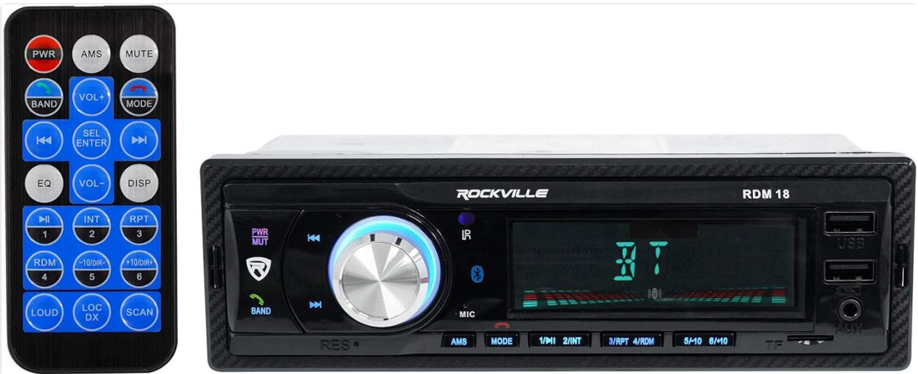
Image: The Rockville RDM18 receiver's display showing "BT ON," indicating that Bluetooth is active and ready for pairing or connection.