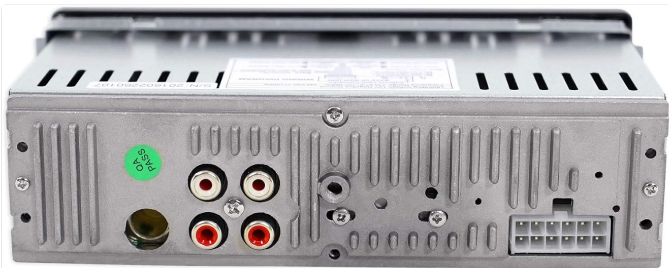
Image: Rear view of the Rockville RDM18 receiver, highlighting the various input and output ports for wiring connections, including RCA outputs and the main power harness connector.