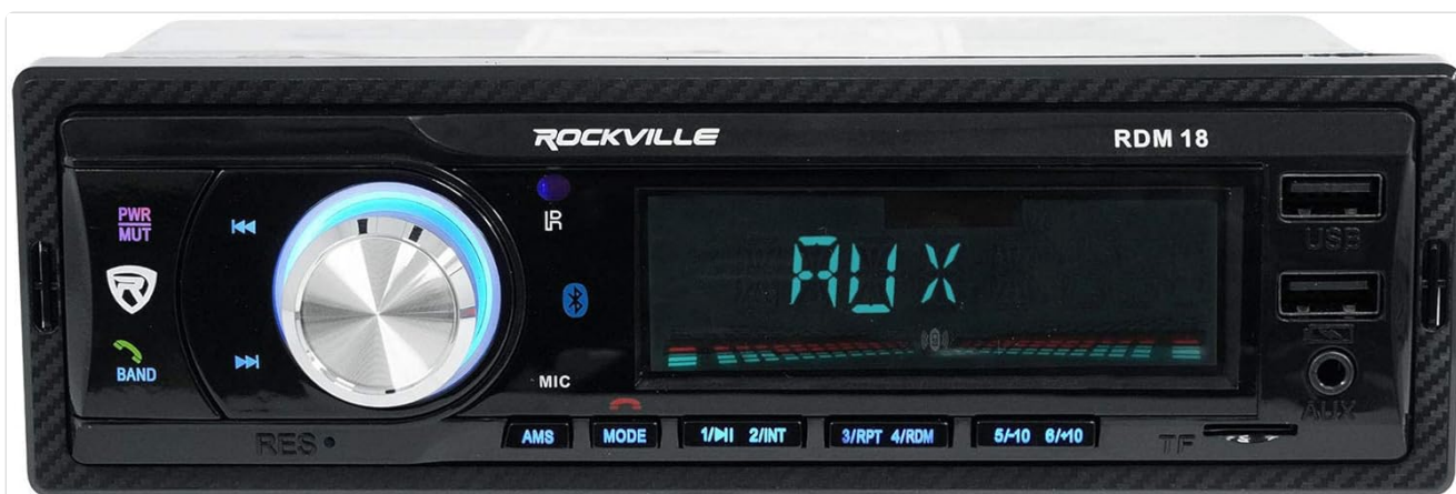
Image: The front panel of the Rockville RDM18 receiver displaying "AUX" mode, indicating the auxiliary input is active.