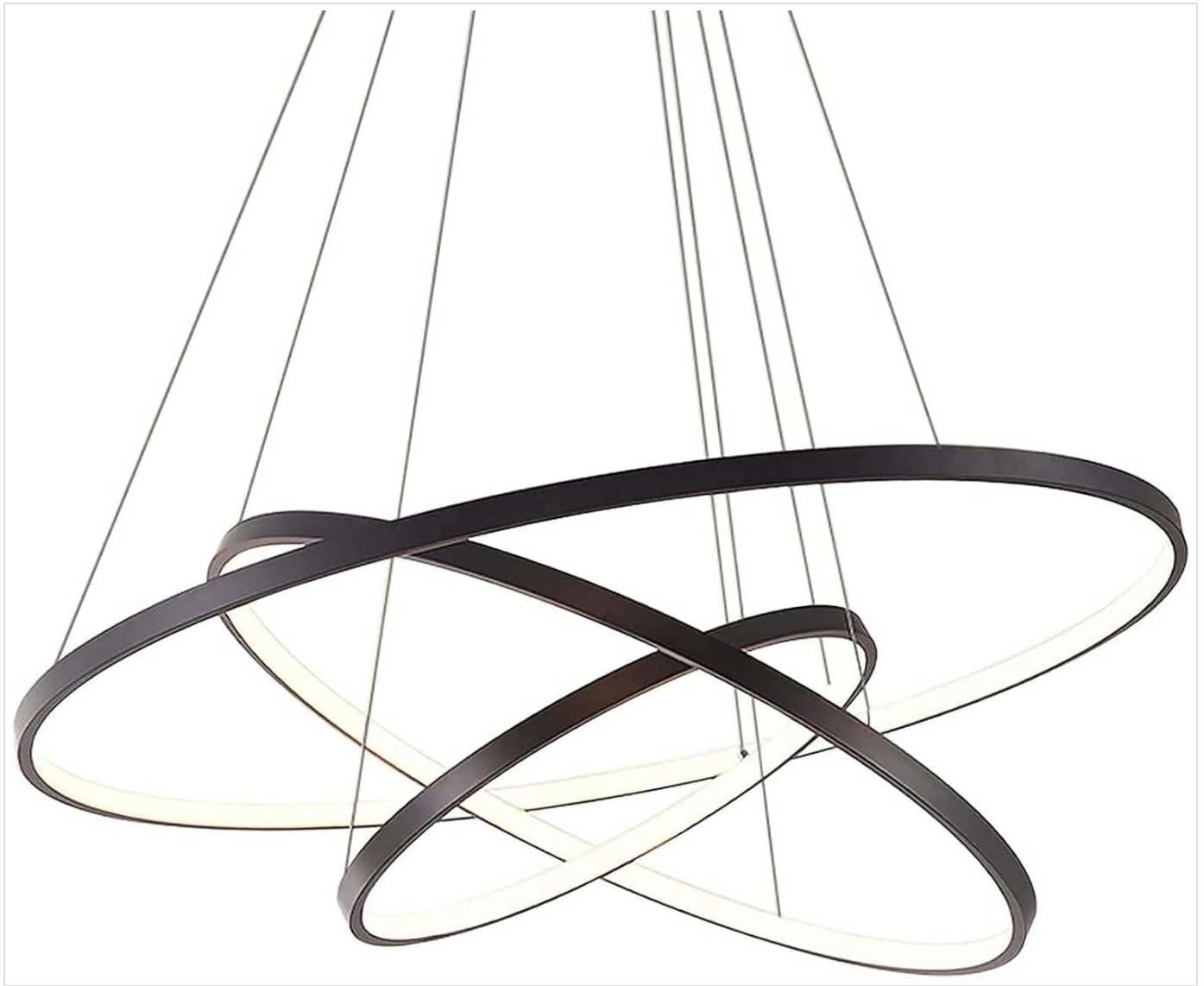
Figure 1: Assembled 3-Ring Chandelier