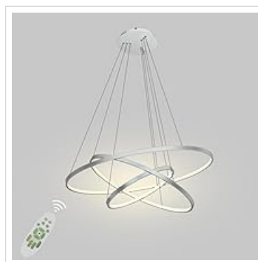
Figure 4: Remote Control for Chandelier Functions

Note: The remote control requires 2 AAA batteries (not included).