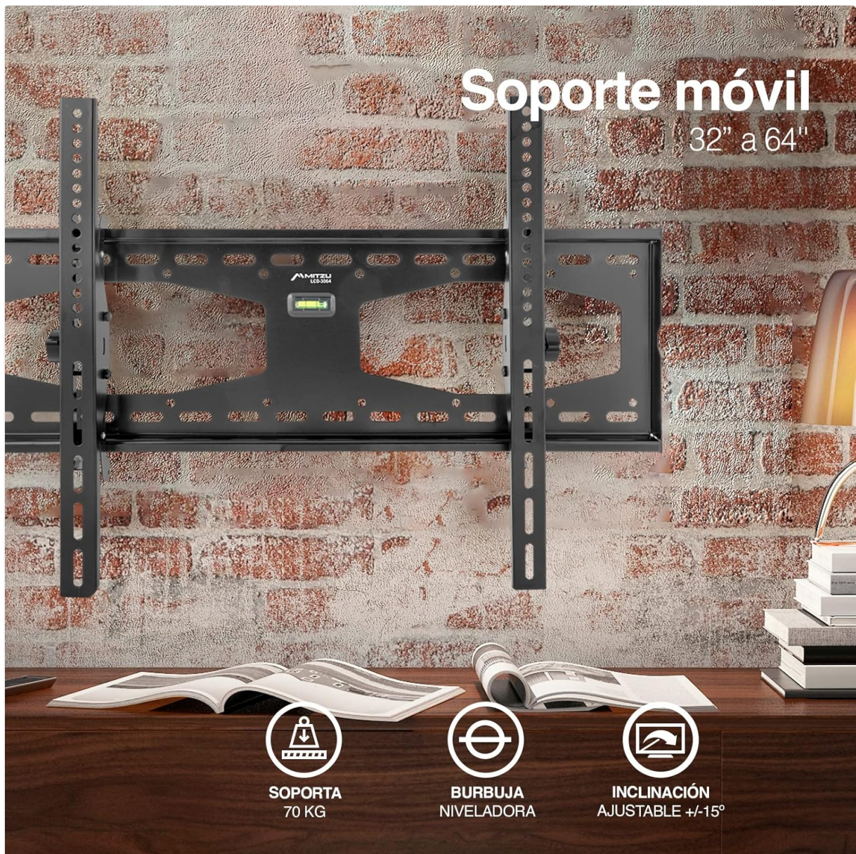
Figure 2: Key features of the Mitzu LCD-3064, including 70 kg support, leveling bubble, and +/-15° tilt.