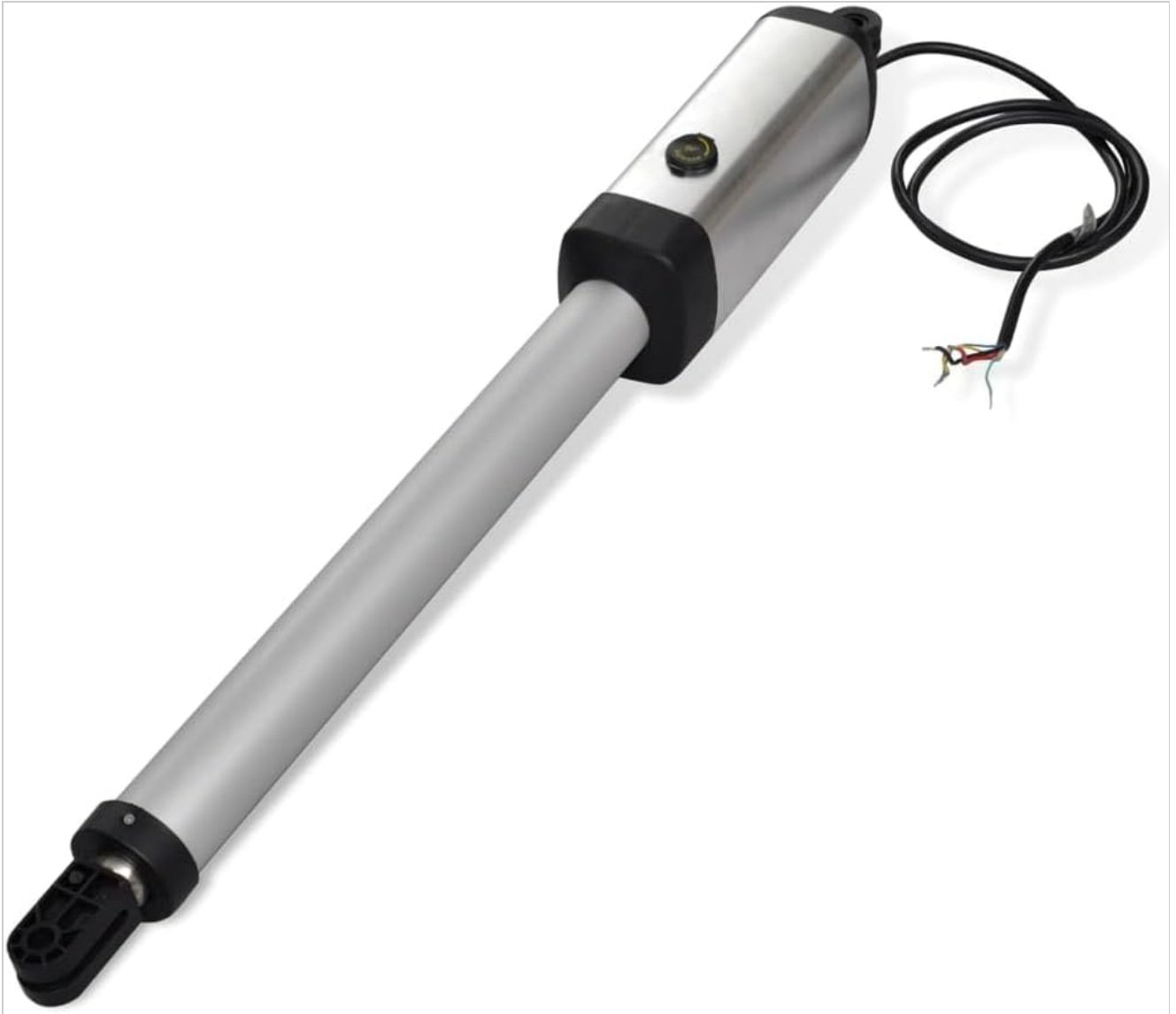
Image: A single gate actuator. This cylindrical device, primarily silver with black end caps, is responsible for the mechanical movement of the gate. Electrical wiring extends from one end for connection to the control box.

installation accessories. Ensure proper alignment for smooth gate movement.