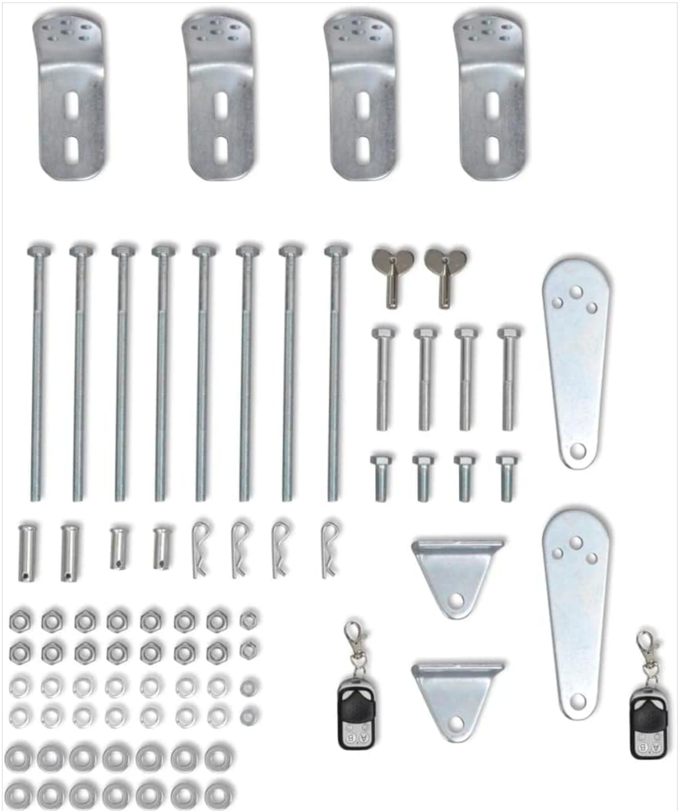
Image: Complete kit of vidaXL Gate Opener components. This includes two gate actuators, a central control box, two remote controls, two emergency release keys, and a variety of installation accessories such as bolts, nuts, and mounting brackets.