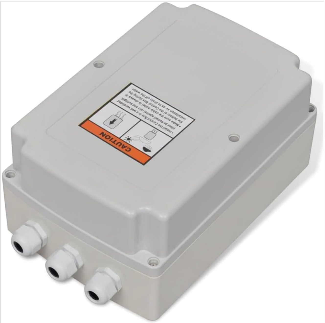
Image: The control box. This grey, rectangular unit houses the electronic components that manage the gate opener's functions. It features cable glands for secure wiring and a caution sticker indicating important safety information regarding installation and water protection.