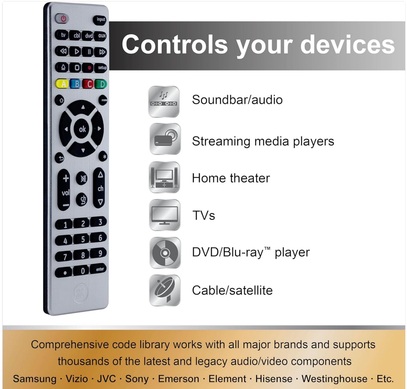
Image: The remote control alongside icons representing various devices it can control, such as Soundbar/Audio, Streaming Media Players, Home Theater, TVs, DVD/Blu-ray Player, and Cable/Satellite.

Once programmed, your GE Universal Remote Control simplifies managing your home entertainment system.