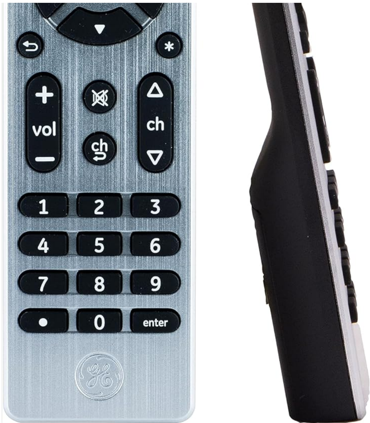
Image: Front and side view of the GE Universal Remote Control in silver finish.