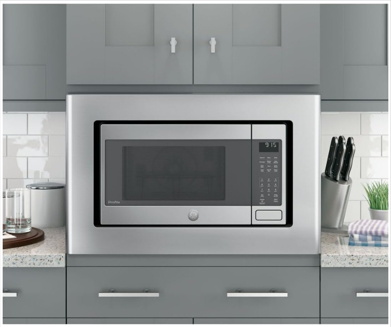
Figure 3: The trim kit providing a built-in look for a microwave in a modern kitchen.