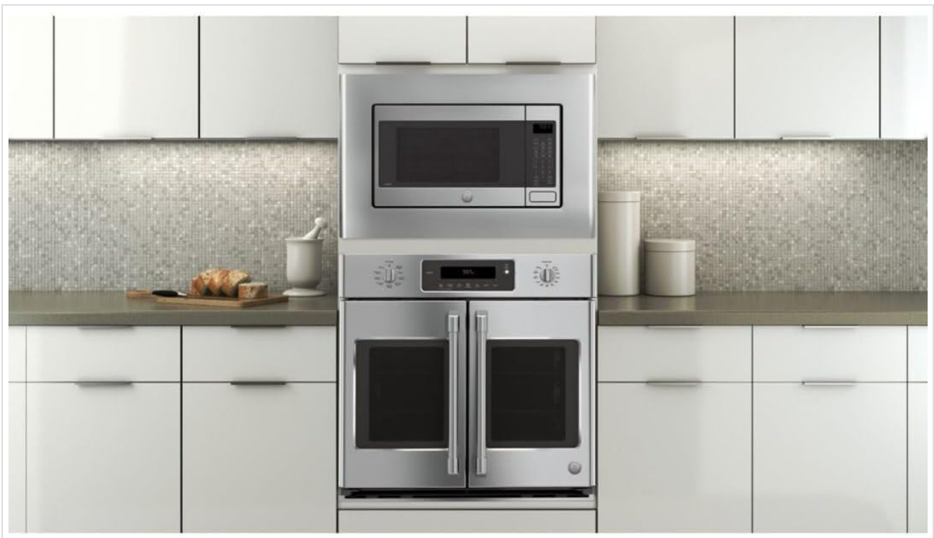
Figure 4: The trim kit creating a cohesive appliance stack with a built-in oven.