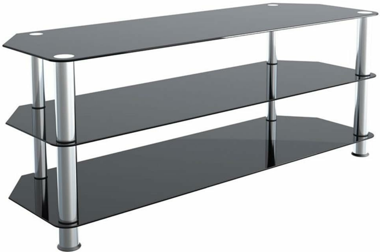
Figure 2: Assembled AVF SDC1250-A TV Stand, showcasing its three black tempered glass shelves and chrome support legs.