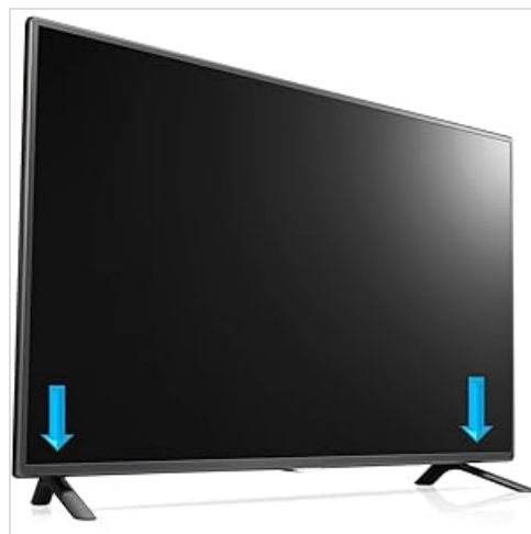
Figure 4: Important notice regarding TV compatibility for models with wide-spread feet. Always measure your TV's base before placement.