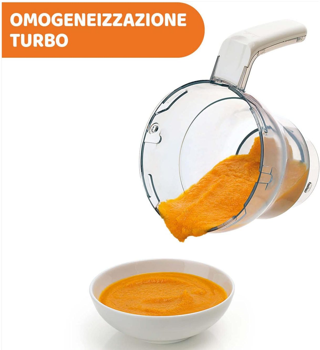
Image: A close-up of the Chicco Easy Meal's blending function. The transparent jar is tilted, pouring smooth, orange pureed food into a white bowl, illustrating the final product after blending.