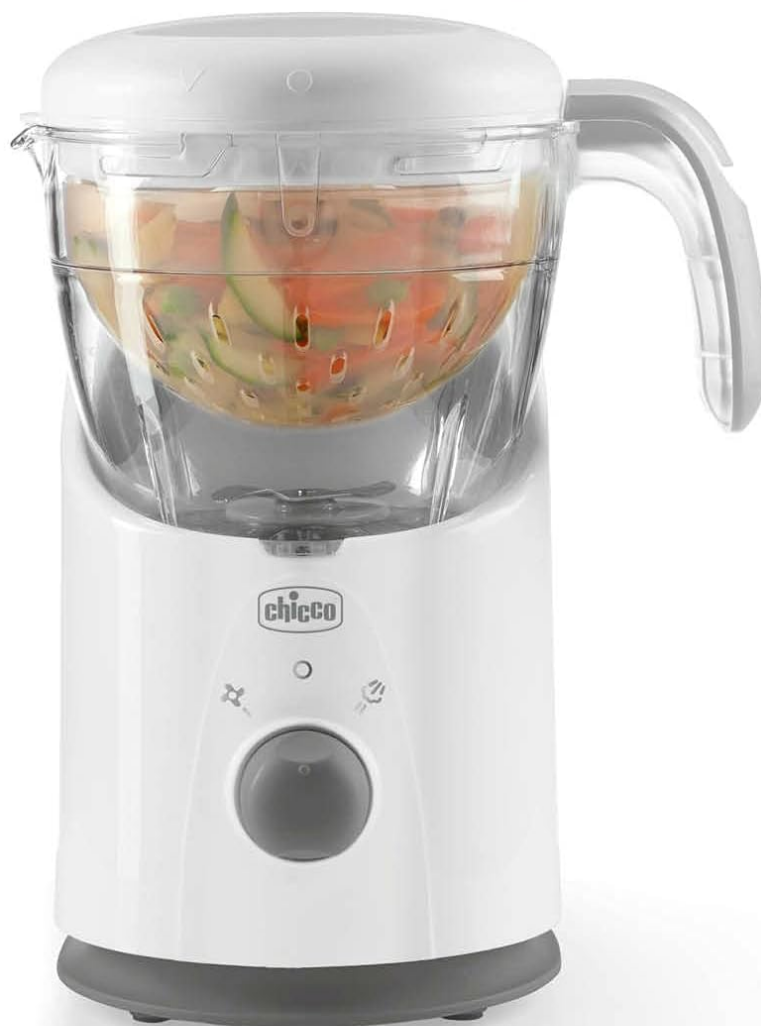
Image: The Chicco Easy Meal Baby Food Maker in operation, demonstrating the steaming function. Chopped vegetables are visible within the transparent steaming basket, indicating the cooking process.