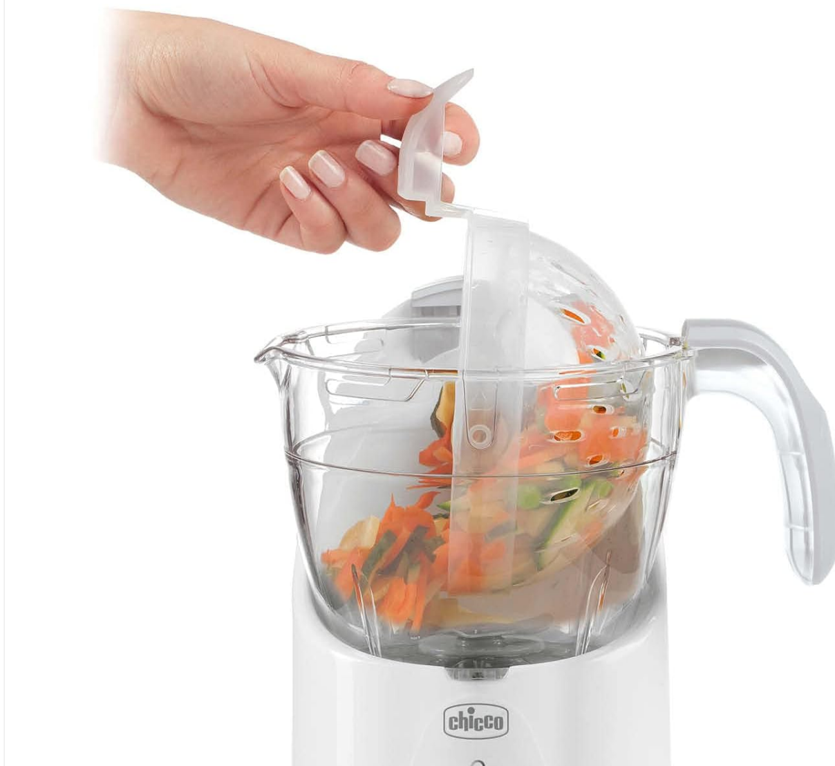
Image: A hand demonstrating the Chicco Easy Meal's Switch System. The steaming basket, filled with cooked vegetables, is being inverted over the blender blades, allowing for easy transfer of ingredients for blending.