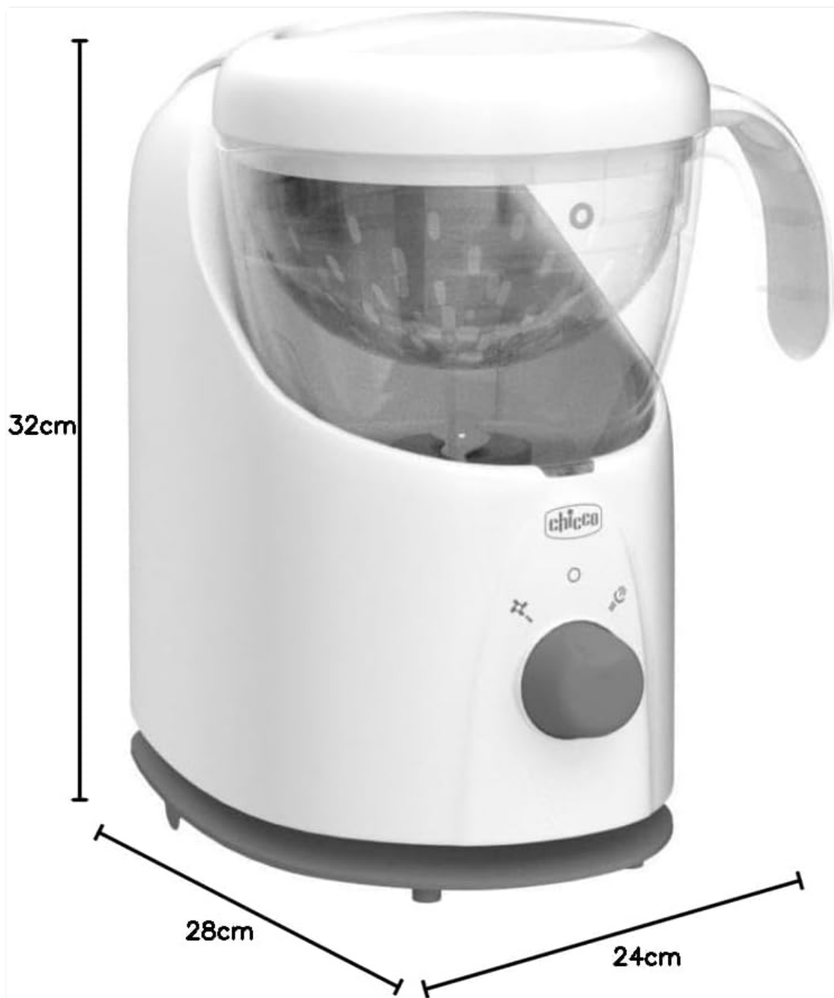
Image: A diagram showing the dimensions of the Chicco Easy Meal Baby Food Maker. The height is 32cm, width 28cm, and depth 24cm.