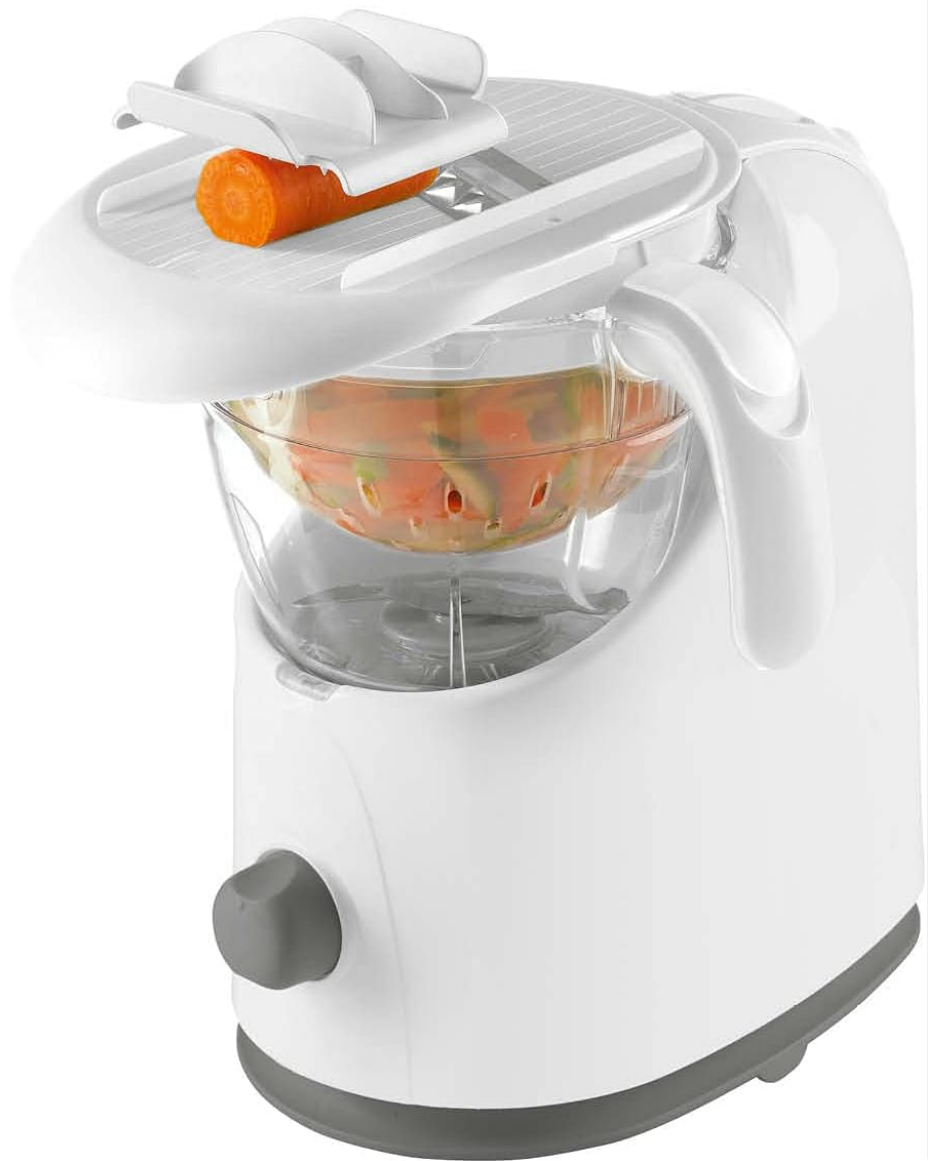
Image: The Chicco Easy Meal Baby Food Maker with the Cut Express grater attachment. A small piece of carrot is being grated, with the thin slices falling directly into the steaming basket below.