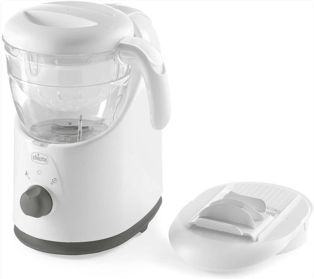
Image: Chicco Easy Meal Baby Food Maker with its grater accessory. The main unit is white and grey, featuring a transparent blending jar and a control knob. The separate grater attachment is also white.