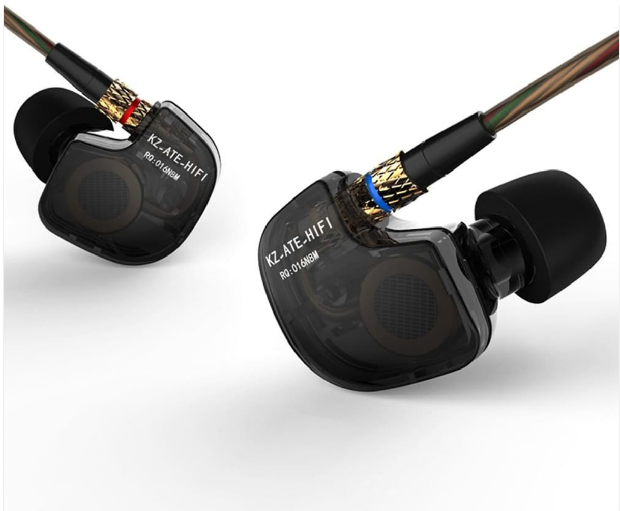
Image: A pair of AWEI KZ-ATE in-ear earphones, showcasing their transparent housing and braided cable design.