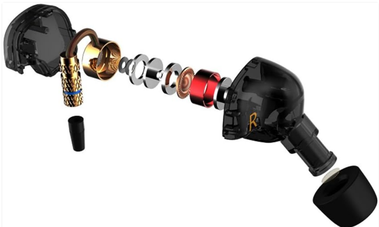
Image: An exploded view illustrating the internal components of the AWEI KZ-ATE earphone, including the driver, housing,

Familiarize yourself with the different components of your AWEI KZ-ATE earphones: