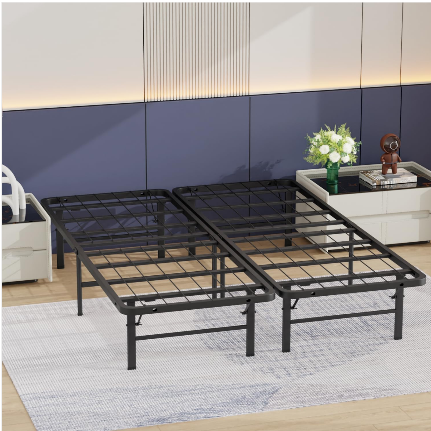
Image: The fully assembled BestMassage Queen Metal Platform Bed Frame, showcasing its sleek black finish and sturdy design.