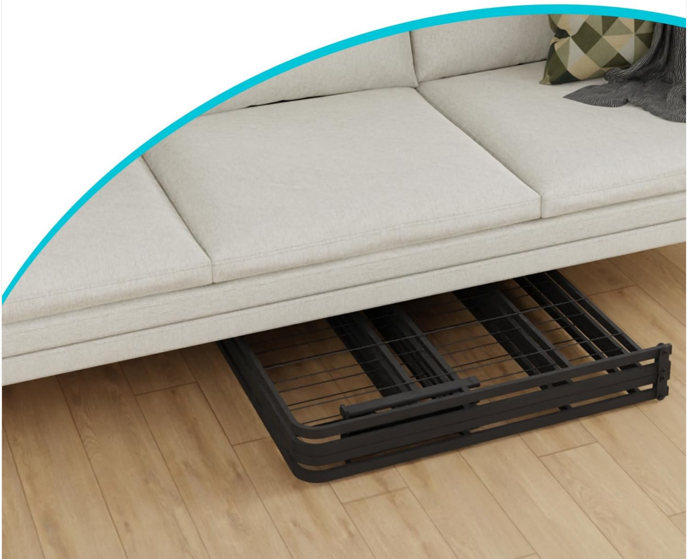
Image: The bed frame in its folded state, demonstrating its compact design for easy storage under furniture or in tight spaces.