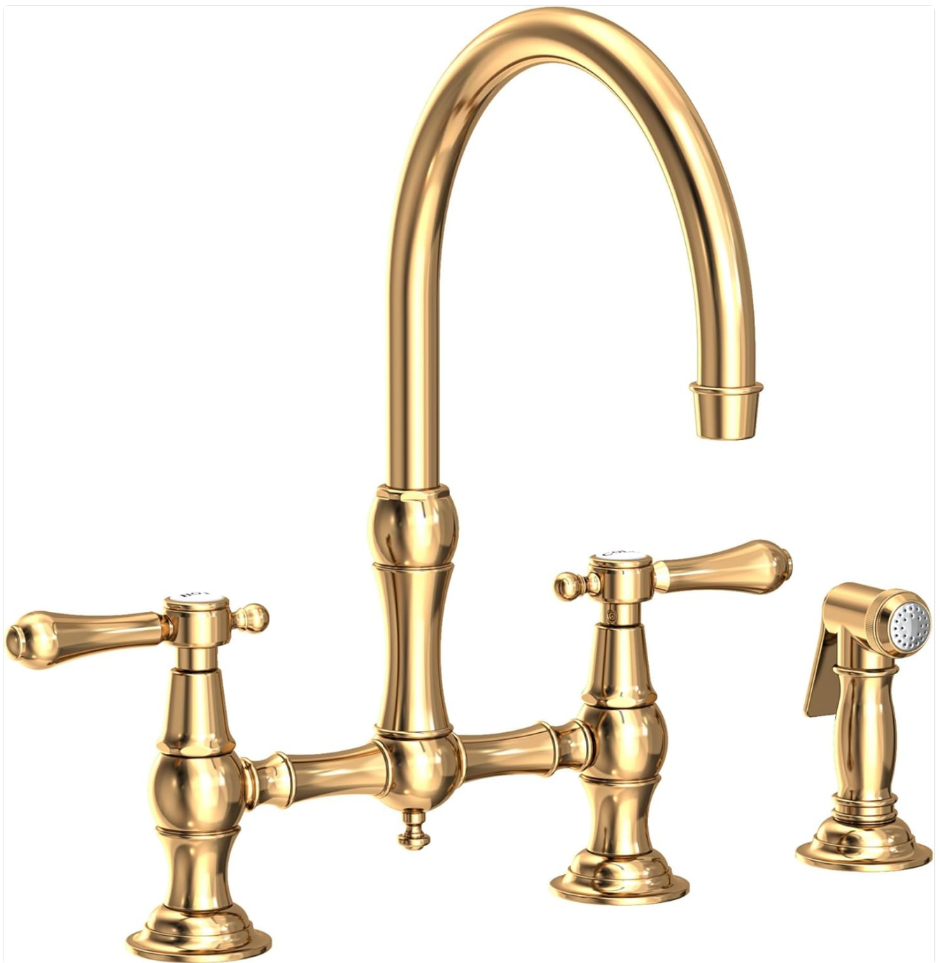
Figure 1: Newport Brass Chesterfield Kitchen Bridge Faucet (Model 9458) in Polished Brass Uncoated finish, featuring a high-arc spout, two lever handles, and a matching side spray.