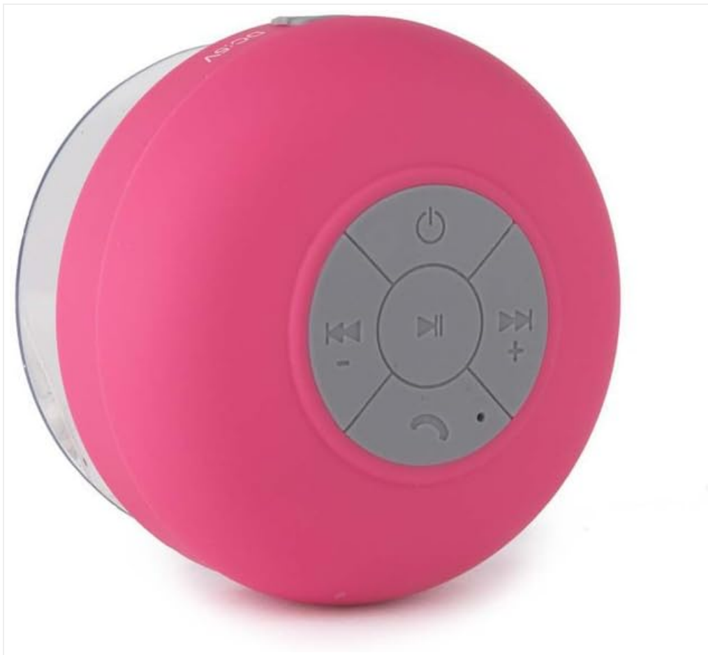
Image: Top view of the pink INTEMPO Shower Speaker, highlighting the central control panel with buttons for Power, Play/Pause, Volume Up/Next Track, Volume Down/Previous Track, and Call Answer/End.

Familiarize yourself with the speaker's controls and features: