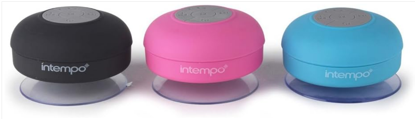
Image: The INTEMPO Shower Speaker, a compact, round, pink Bluetooth speaker with a suction cup base.

Thank you for purchasing the INTEMPO Shower Speaker. This manual provides essential information for the safe and efficient operation of your device. Please read these instructions carefully before use and retain them for future reference.