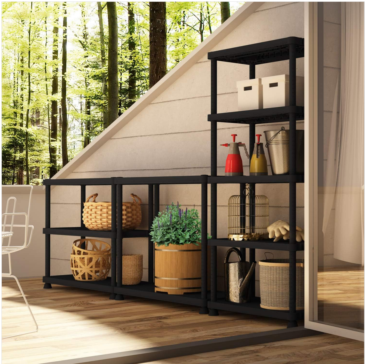
Figure 6: Shelving unit in an outdoor setting.

This image shows the shelving unit placed on a balcony, indicating its suitability for both indoor and outdoor storage solutions.