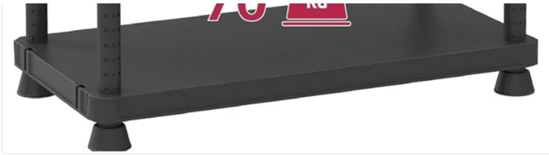
Figure 2: Maximum weight capacity per shelf.

This visual guide highlights the maximum weight load each shelf can safely support, which is 70 kg or 154 pounds.