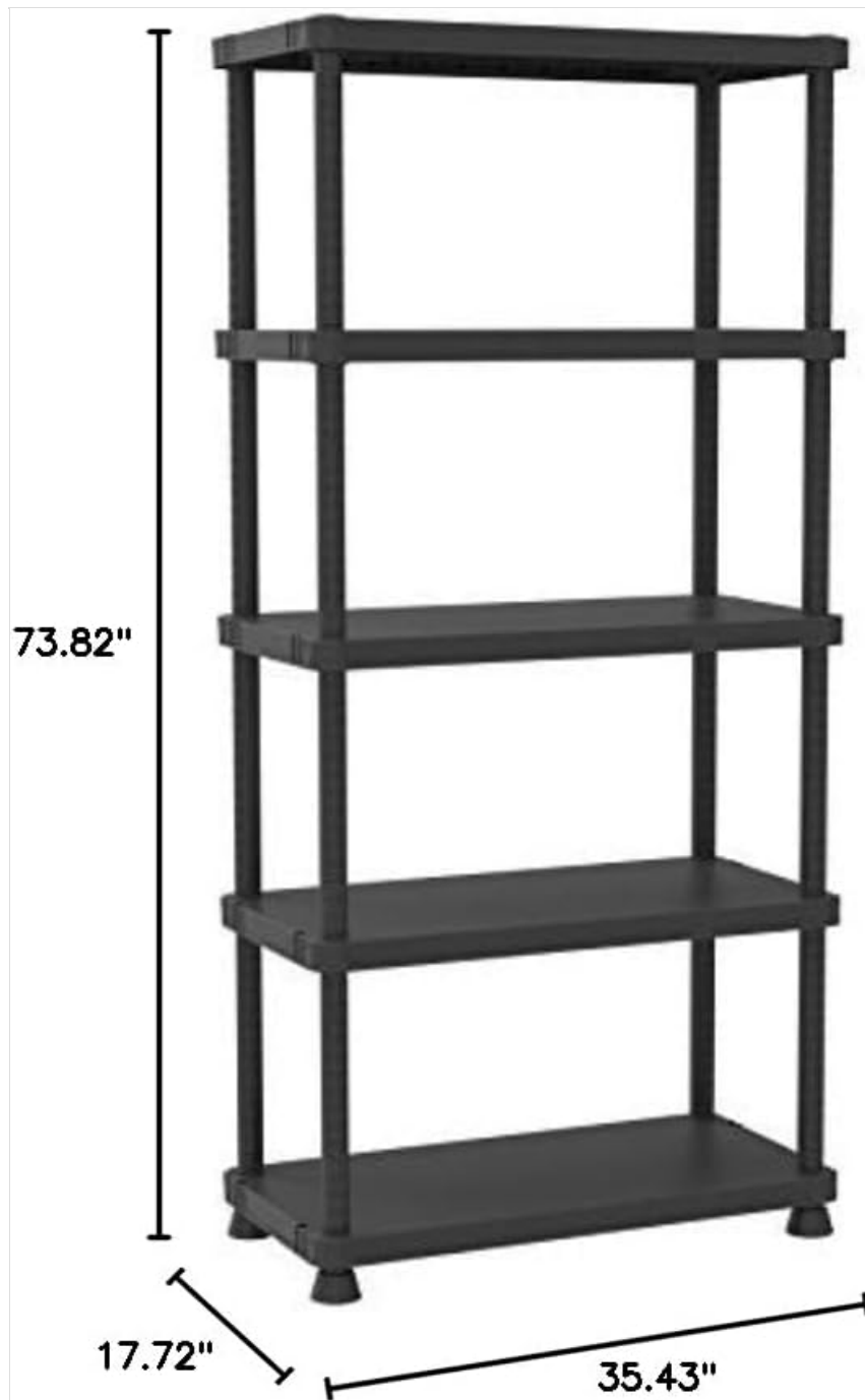
Figure 8: Product dimensions.

This diagram illustrates the overall dimensions of the shelving unit, providing depth, width, and height measurements.