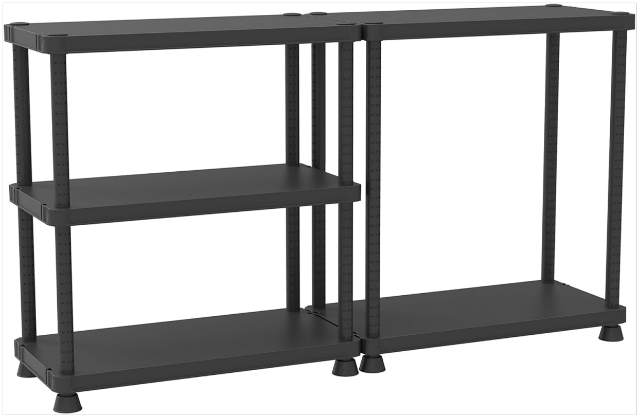
Figure 4: Example of a modular configuration.

This image demonstrates one of the modular assembly options, where the unit is configured into two separate, lower sections for flexible storage.