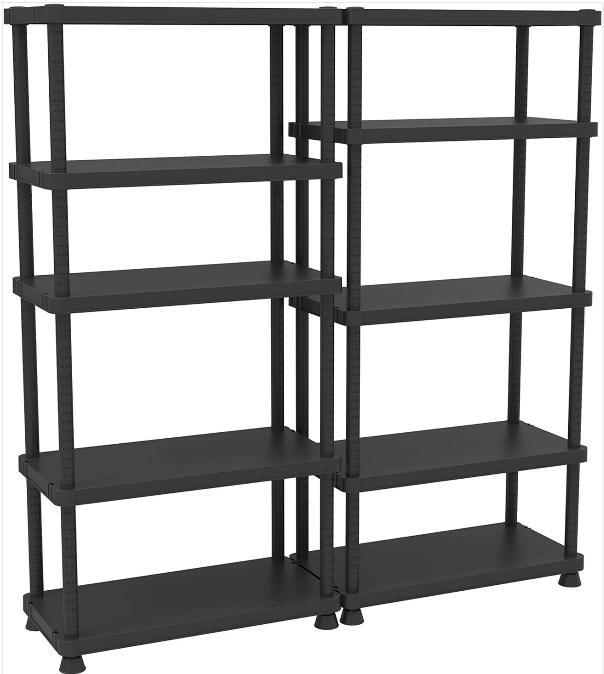
Figure 5: Example of an L-shaped modular arrangement.

An illustration of how multiple shelving units can be connected and arranged in an L-shape to optimize corner spaces.