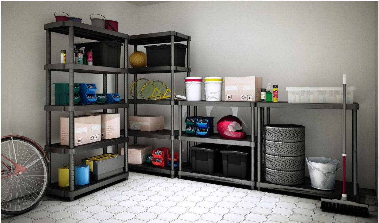
Figure 7: Shelving units in a garage setting.

An example of the shelving unit's practical application in a garage environment, demonstrating its capacity to organize various items.