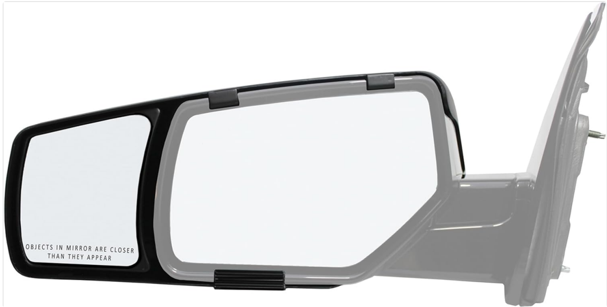
Image 2: Front view of the towing mirror extension, showing the clip design for easy installation.

The extension is engineered not to interfere with the original equipment (OE) mirror glass, allowing full functionality of your vehicle's existing mirror.