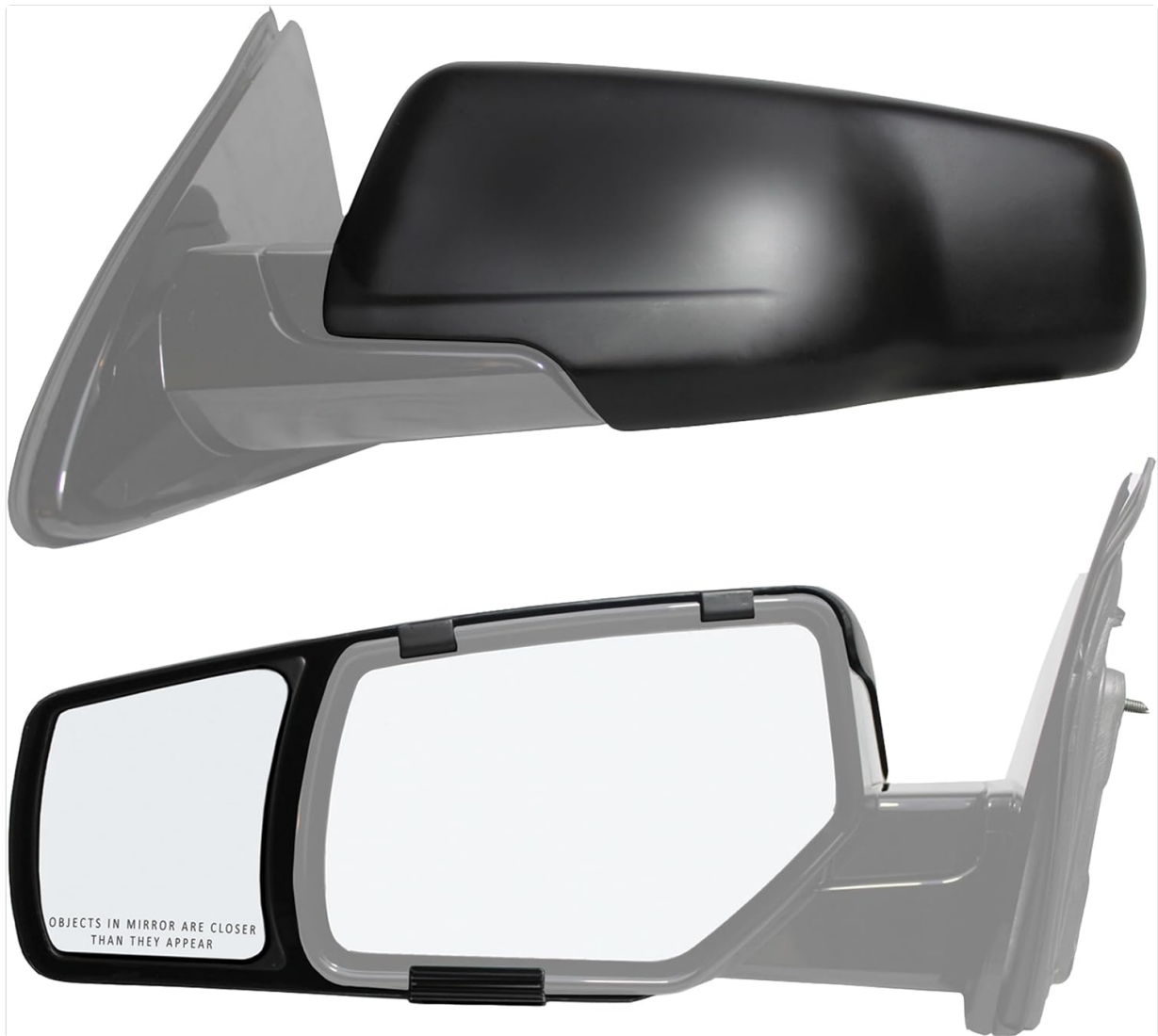
Image 1: The Fit System 80920 Snap & Zap Towing Mirror Pair, showing both driver and passenger side extensions.