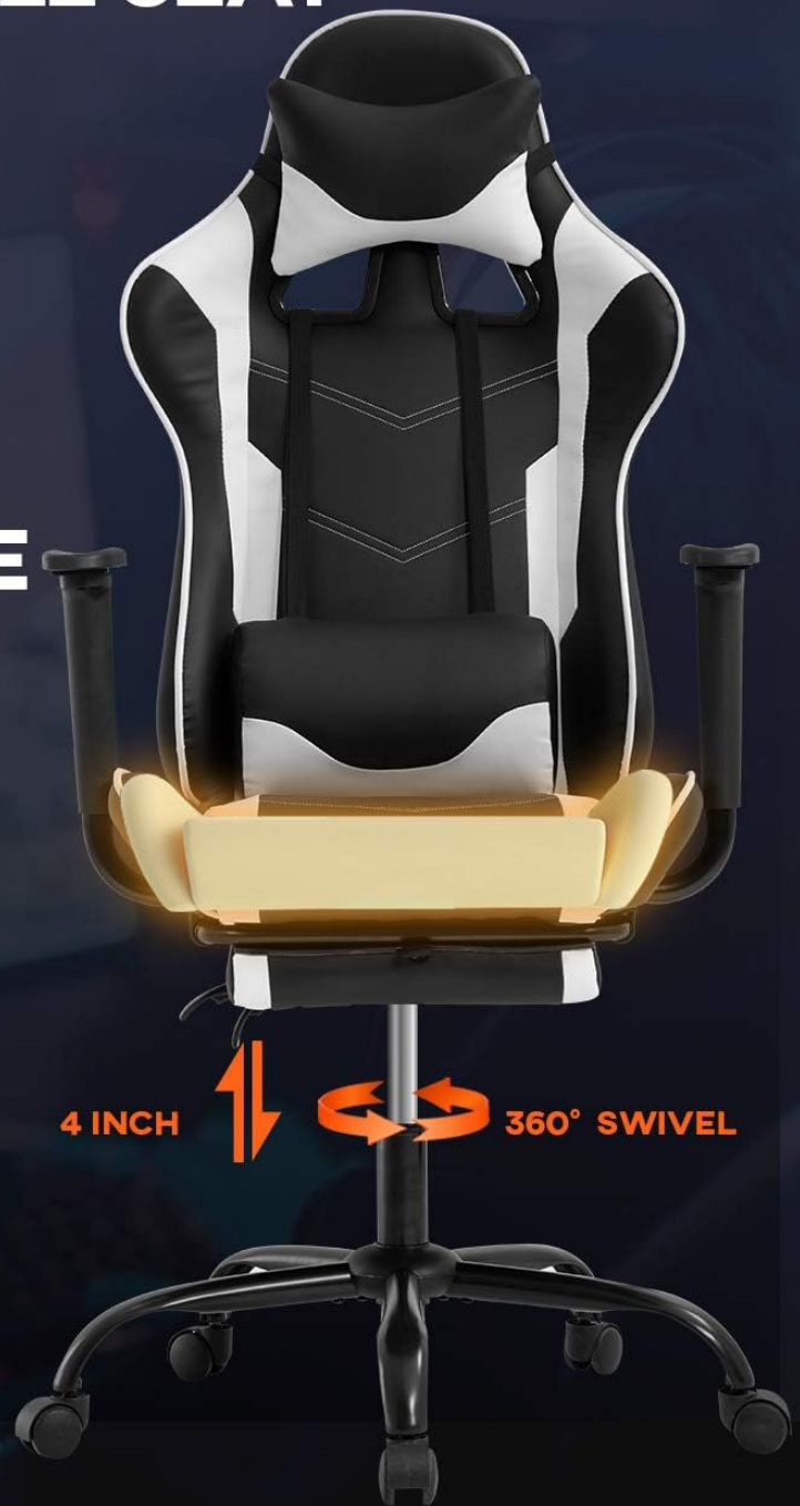
Image 3.3: Illustration of the chair's comfortable, thickly padded seat, demonstrating its 4-inch adjustable height range and 360-degree swivel capability.