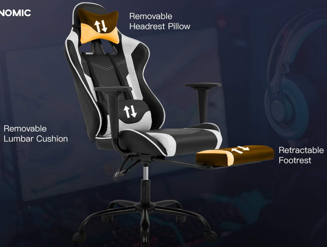
Image 3.2: An overview of the chair's multi-functional components, highlighting the removable headrest pillow, removable lumbar cushion, and retractable footrest.