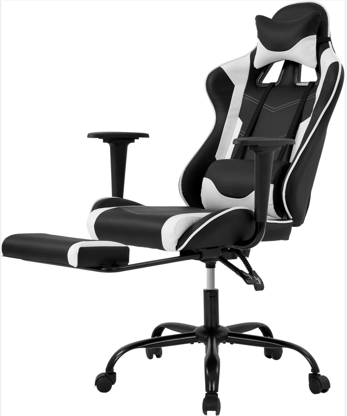
Image 1.1: Full view of the BestOffice Ergonomic PC Racing Gaming Chair in white and black, featuring a retractable footrest.