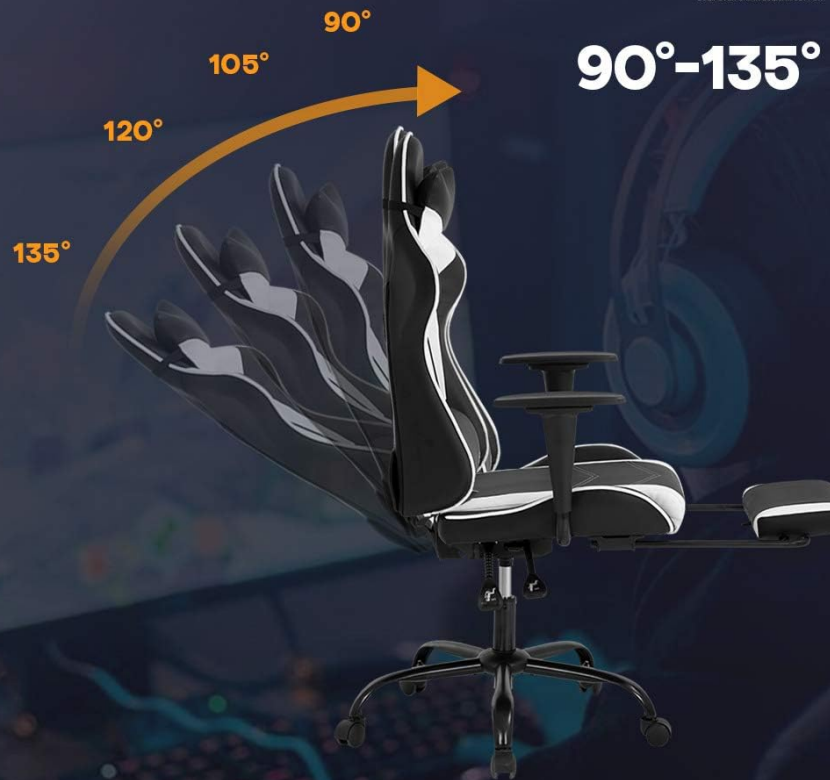
Image 5.1: Visual representation of the adjustable backrest, showing recline angles for working (90°), gaming (105°), reading (120°), and napping (135°).