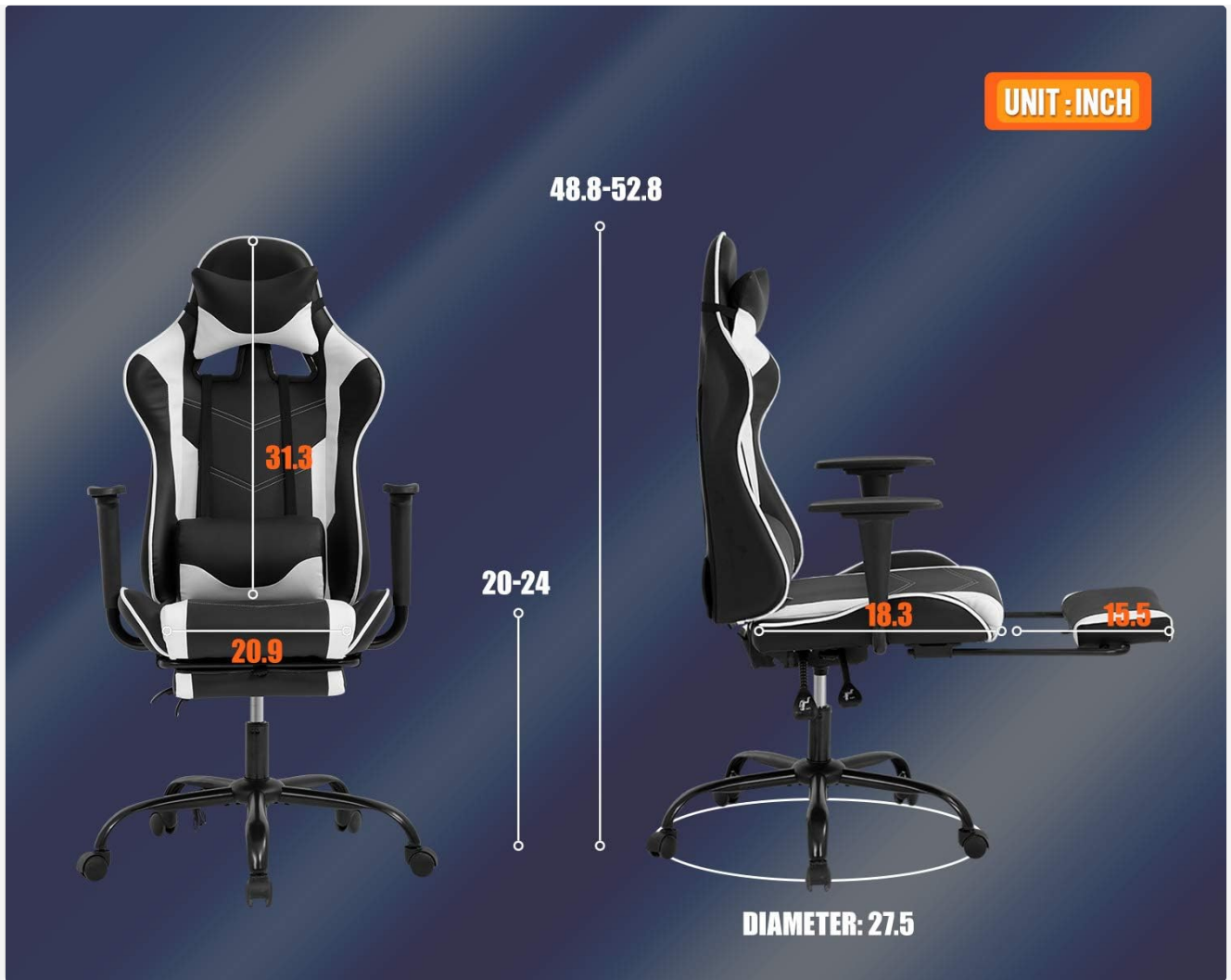
Image 8.1: Detailed dimensions of the chair in inches, including seat width, backrest height, and overall height range.