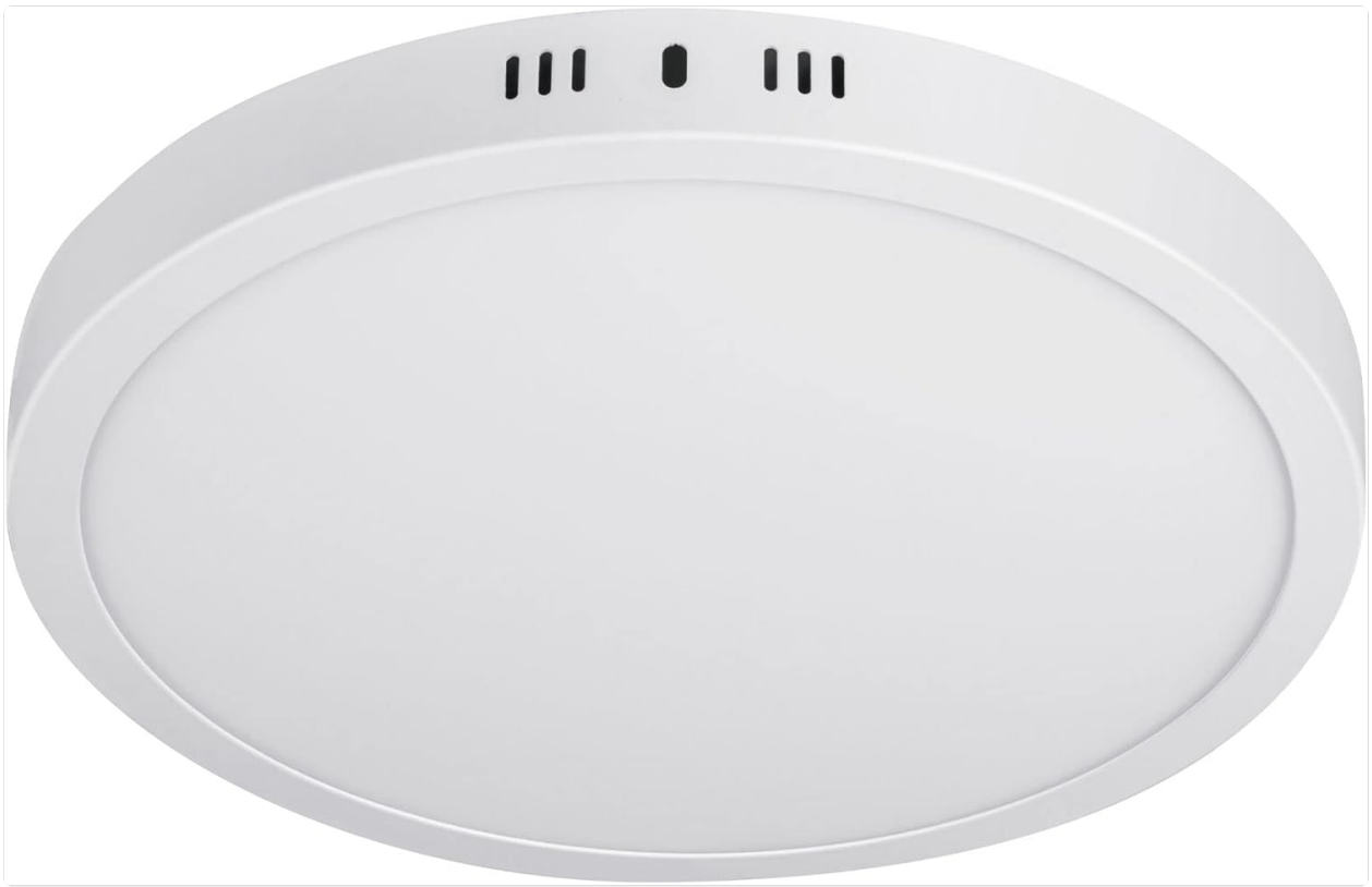
Figure 2.1: Volteck PLA-209L 24W LED Round Ceiling Light.