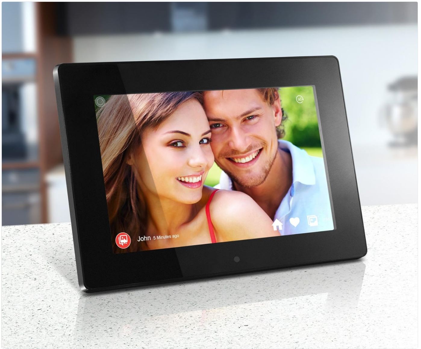
Image: The Aluratek 10-inch digital photo frame displaying a vibrant photo of a smiling couple, showcasing the IPS display quality.