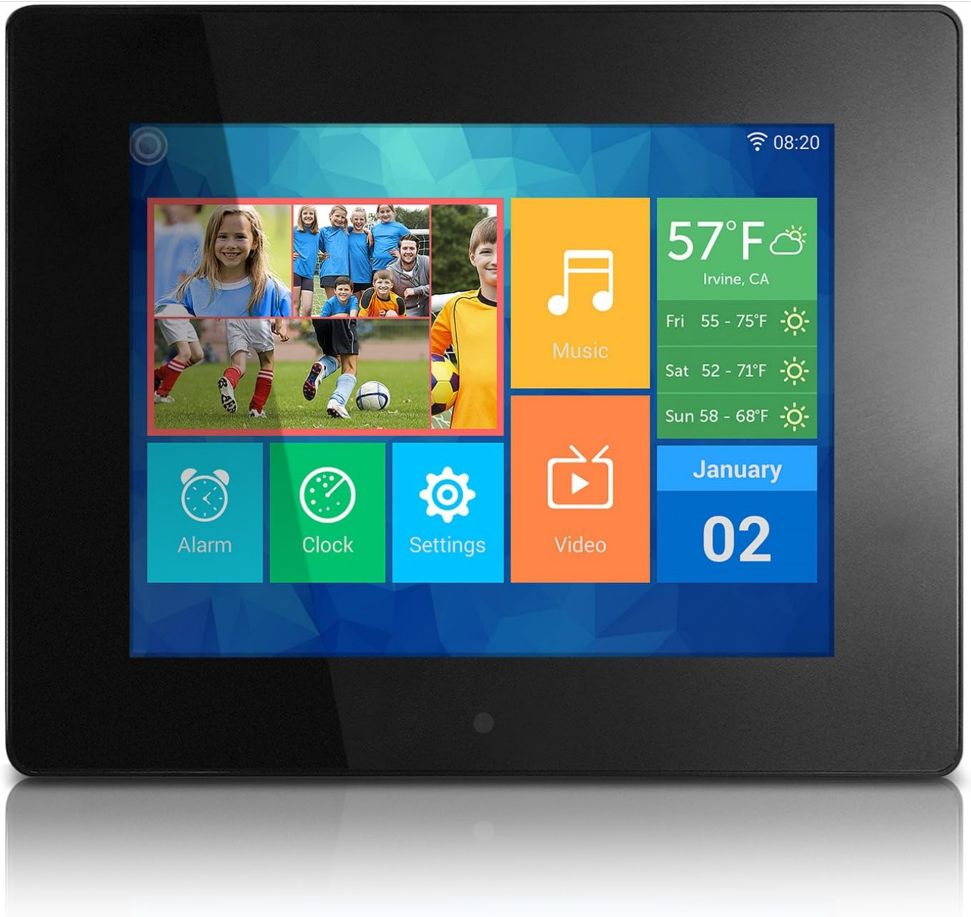
Image: The main menu interface of the Aluratek 10-inch digital photo frame, showing icons for various functions like photos, music, settings, and weather.

Upon first use, the frame will guide you through the Wi-Fi setup process. Select your Wi-Fi network from the list and enter the password using the on-screen keyboard. A stable Wi-Fi connection is essential for sharing photos wirelessly and accessing online features.