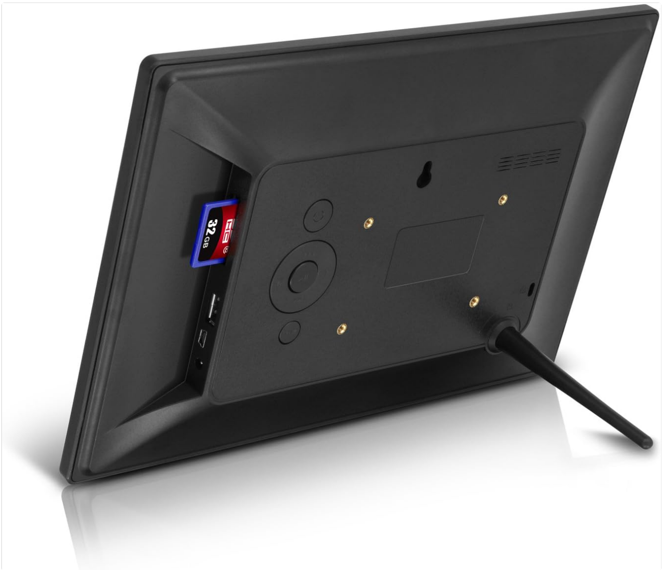
Image: Rear view of the Aluratek 10-inch digital photo frame, showing an SD card partially inserted into its dedicated slot, indicating external storage capability.