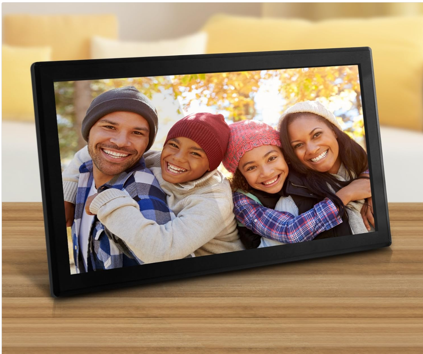
Image: The Aluratek 10-inch digital photo frame displaying a warm family photo, demonstrating its use as a personal display for cherished memories.

For a visual guide on how to use the frame's features, including media playback, please refer to the official product video: