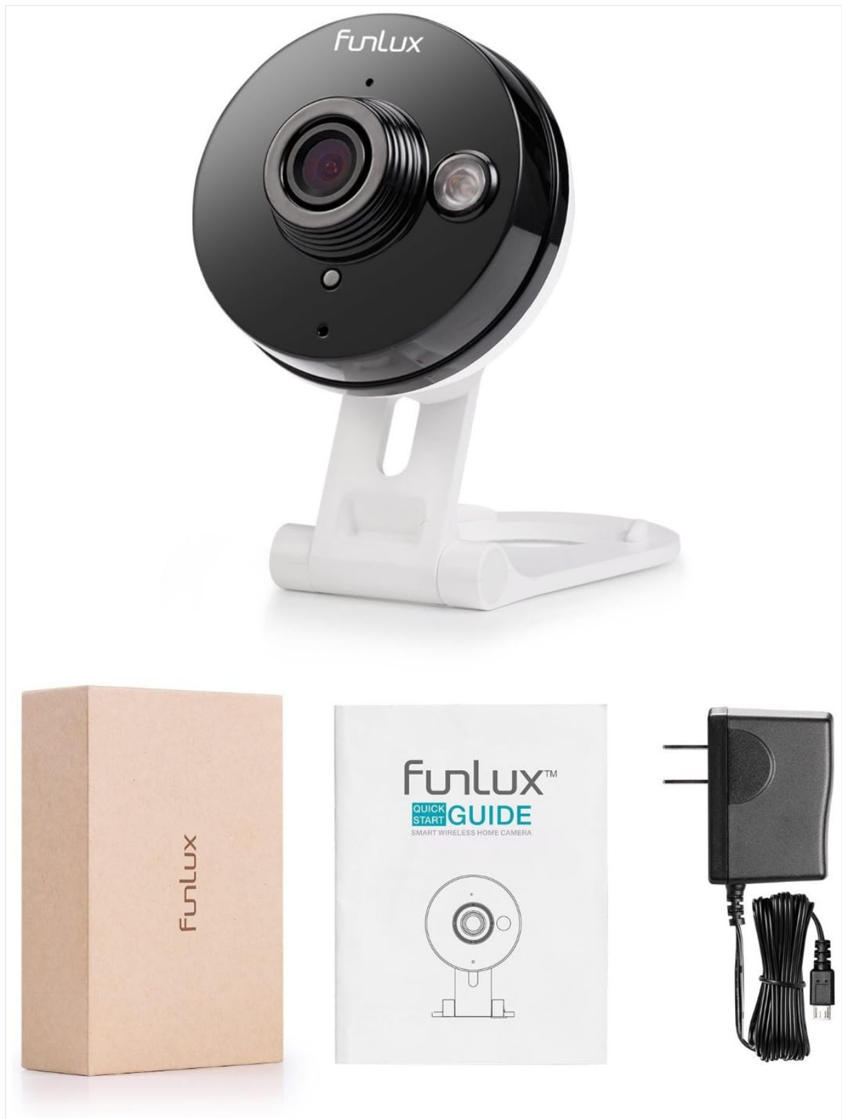
Figure 1.1: Package contents of the Funlux 720p HD Wireless Camera.