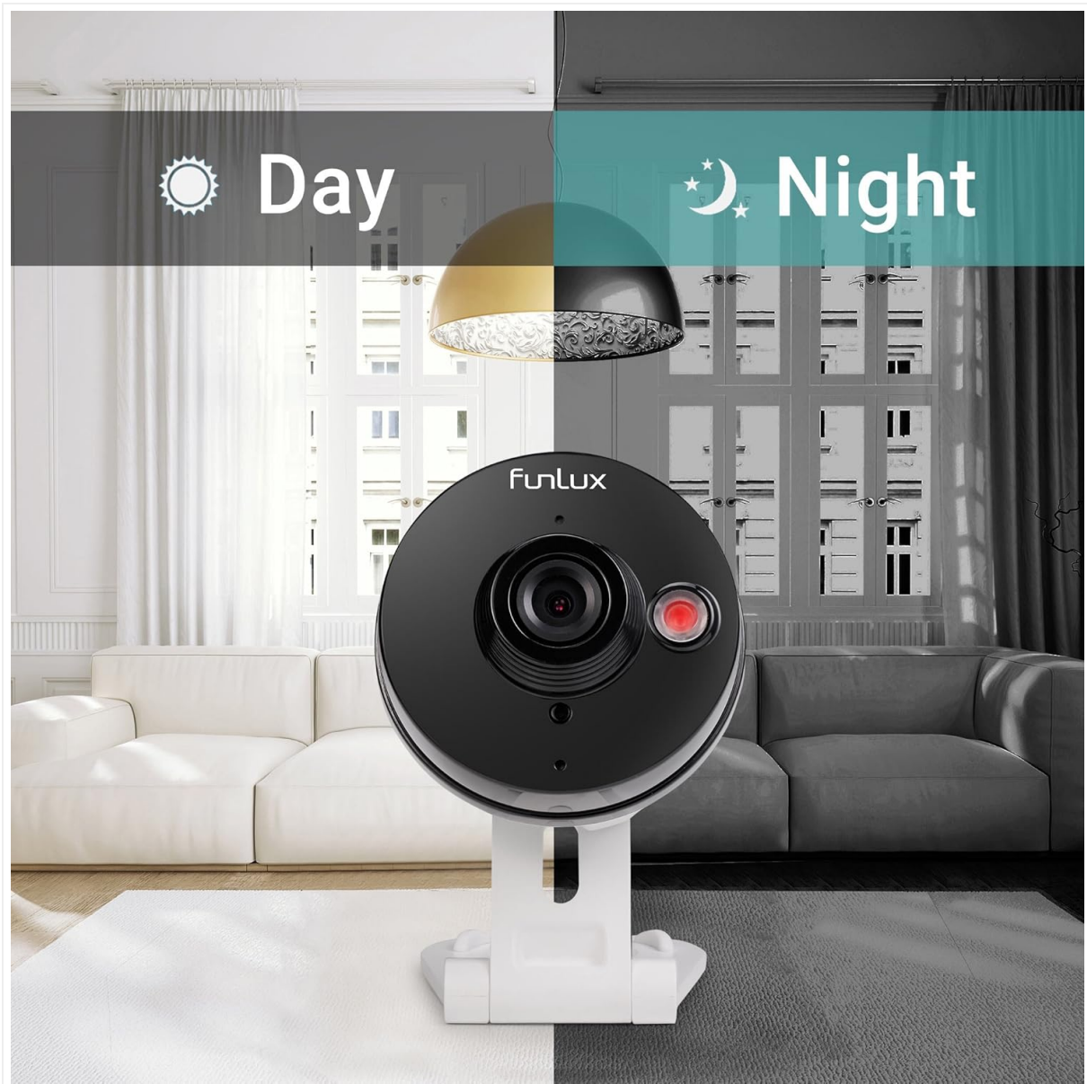
Figure 2.3: Day and Night vision capabilities of the Funlux camera.