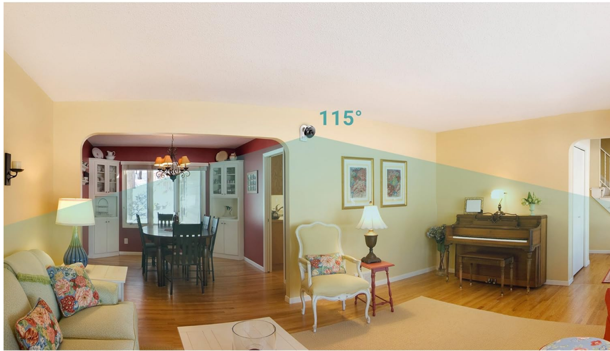
Figure 2.2: Illustration of the camera's 115° wide-angle coverage.