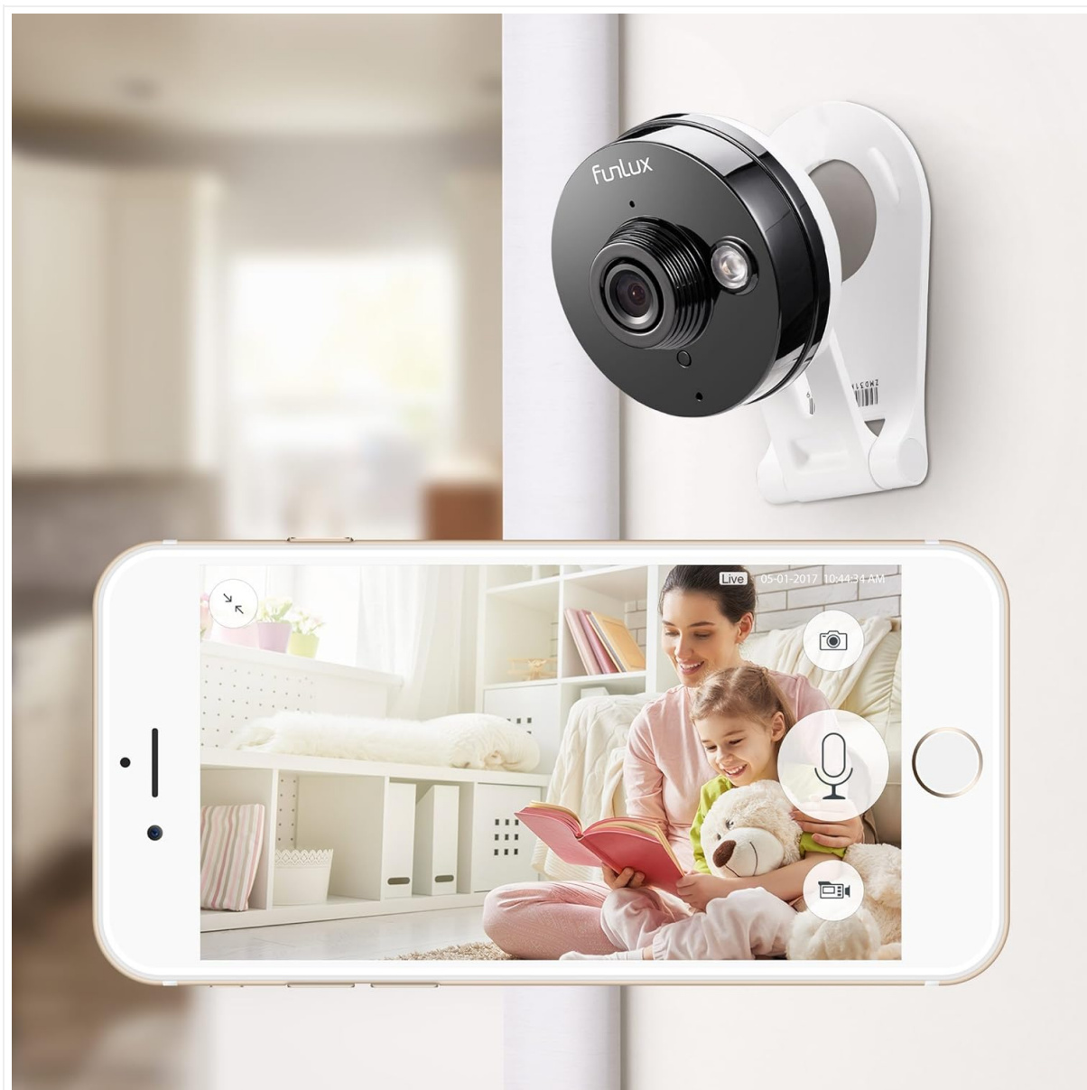
Figure 1.2: Funlux camera mounted and displaying live feed on a smartphone.