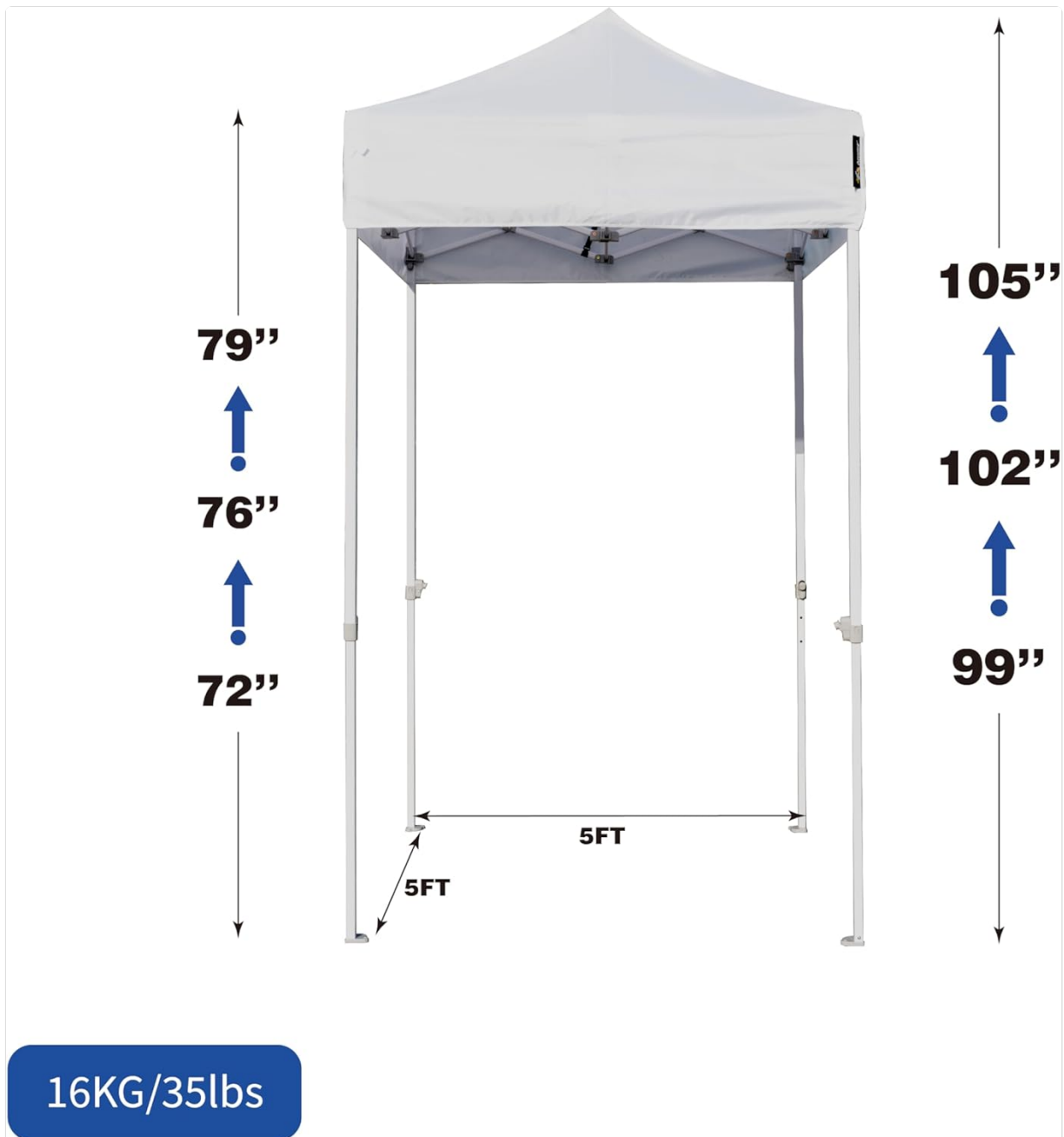
Figure 1: All components included with the American Phoenix 5x5 Pop Up Portable Canopy Tent.