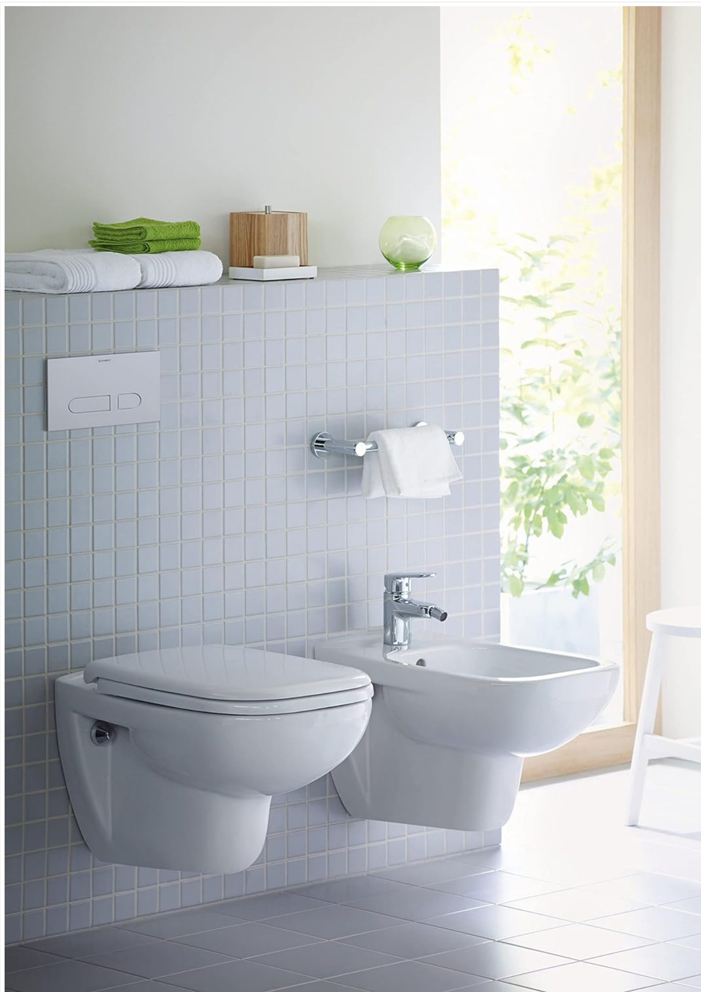
Image 4.2: Duravit D-Code Compact toilet seat correctly installed.