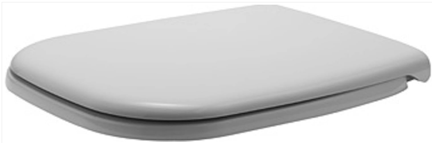
Image 1.1: Duravit D-Code Compact Soft-Close Toilet Seat in closed position.

The Duravit D-Code Compact toilet seat is designed for specific Duravit D-Code ceramic series WCs, offering a space-saving solution with its shortened projection. It features a soft-closing mechanism for quiet operation and is constructed from durable urea thermoset material with stainless steel hinges.