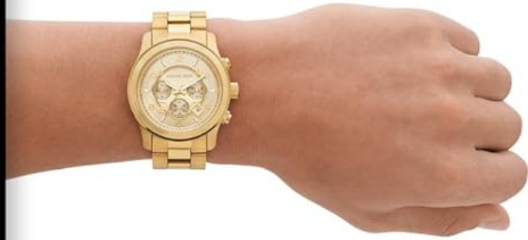
Figure 3: Visual representation of watch sizing on a wrist.