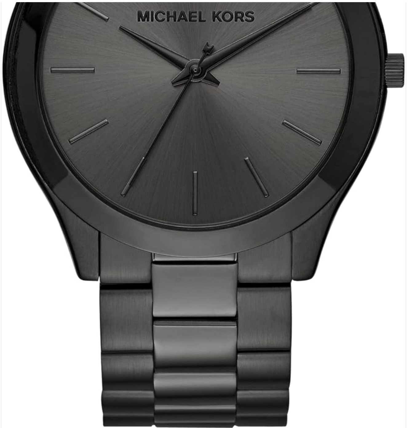
Figure 1: Front view of the Michael Kors Slim Runway watch.