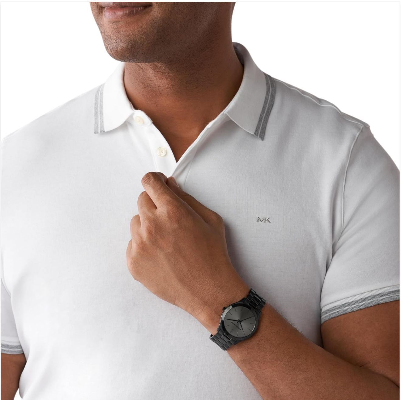
Figure 4: The watch worn on a wrist.