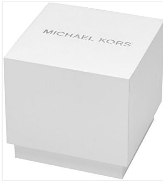
Figure 5: Product packaging for the Michael Kors watch.