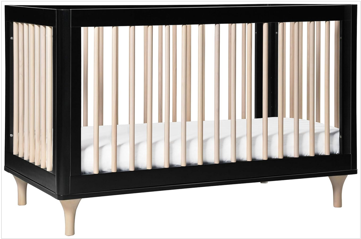
Image: The Babyletto Lolly 3-in-1 Convertible Crib, illustrating its overall structure and dimensions.