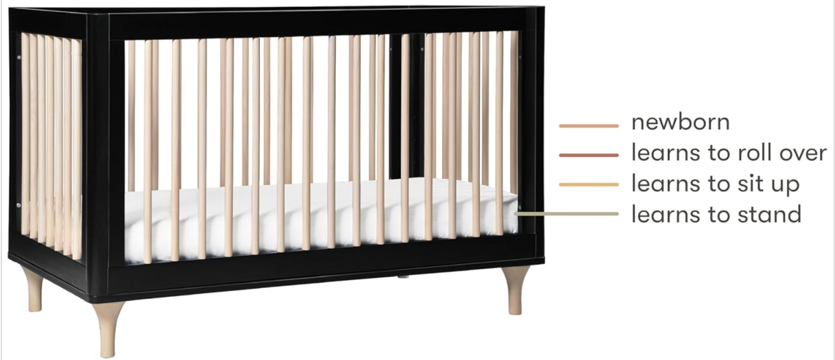
Image: The Babyletto Lolly Crib in its toddler bed configuration, featuring a partial side rail for easy access.