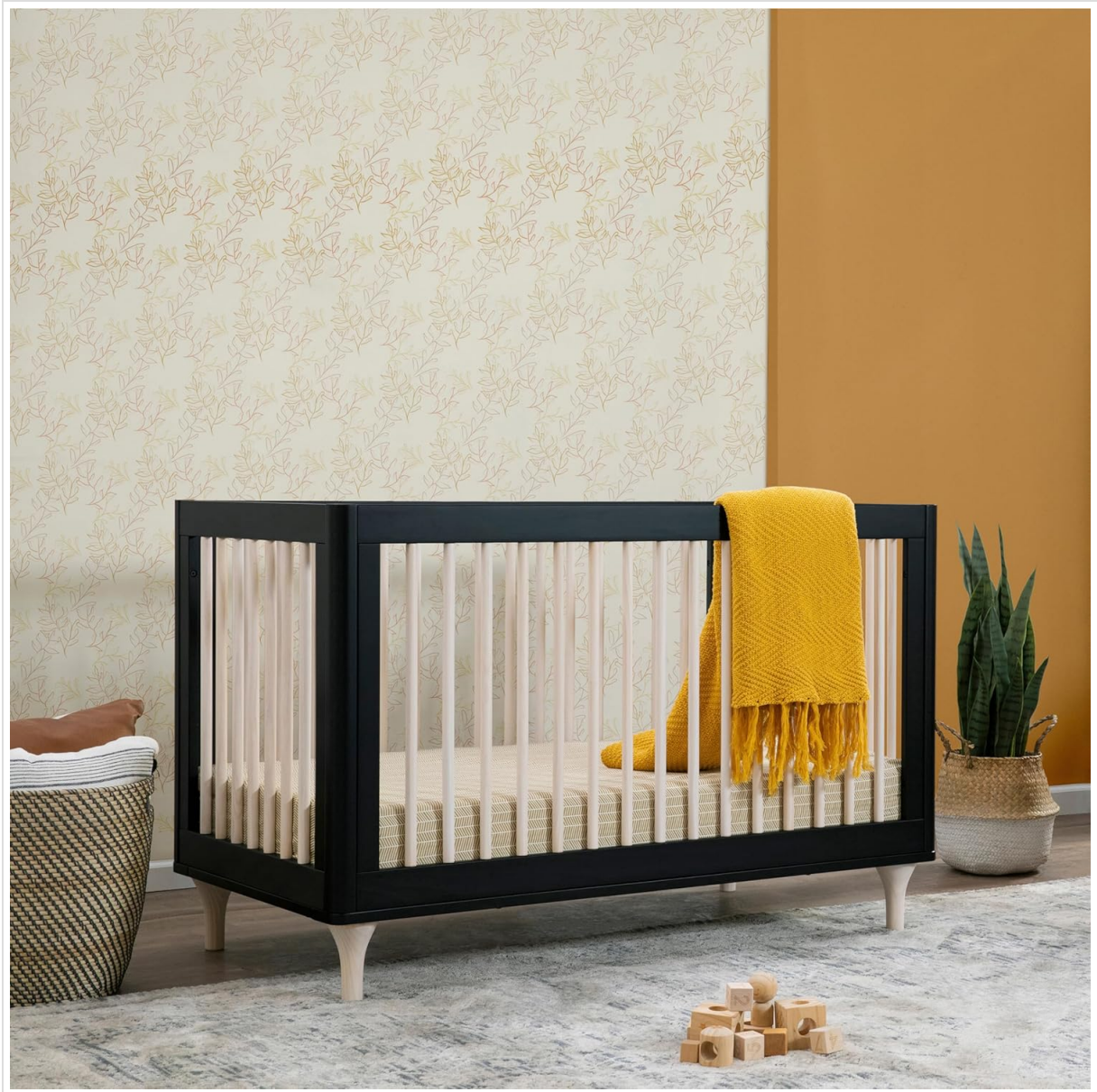
Image: Front view of the Babyletto Lolly 3-in-1 Convertible Crib, showcasing its black frame and natural wood spindles.