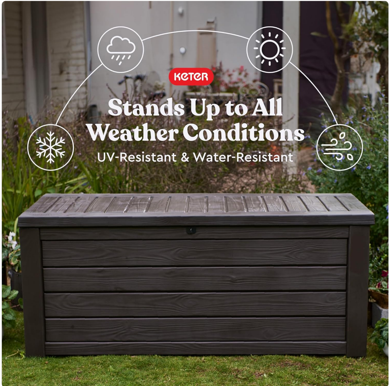
Figure 6: The Keter Deck Box is built to stand up to all weather conditions, being UV-resistant and water-resistant.

The Keter Westwood Deck Box is constructed from UV-resistant and water-resistant resin, designed to withstand various weather conditions without rusting, peeling, fading, or denting. While highly durable, regular inspection for any debris accumulation in seams can help maintain its water-tight seal.