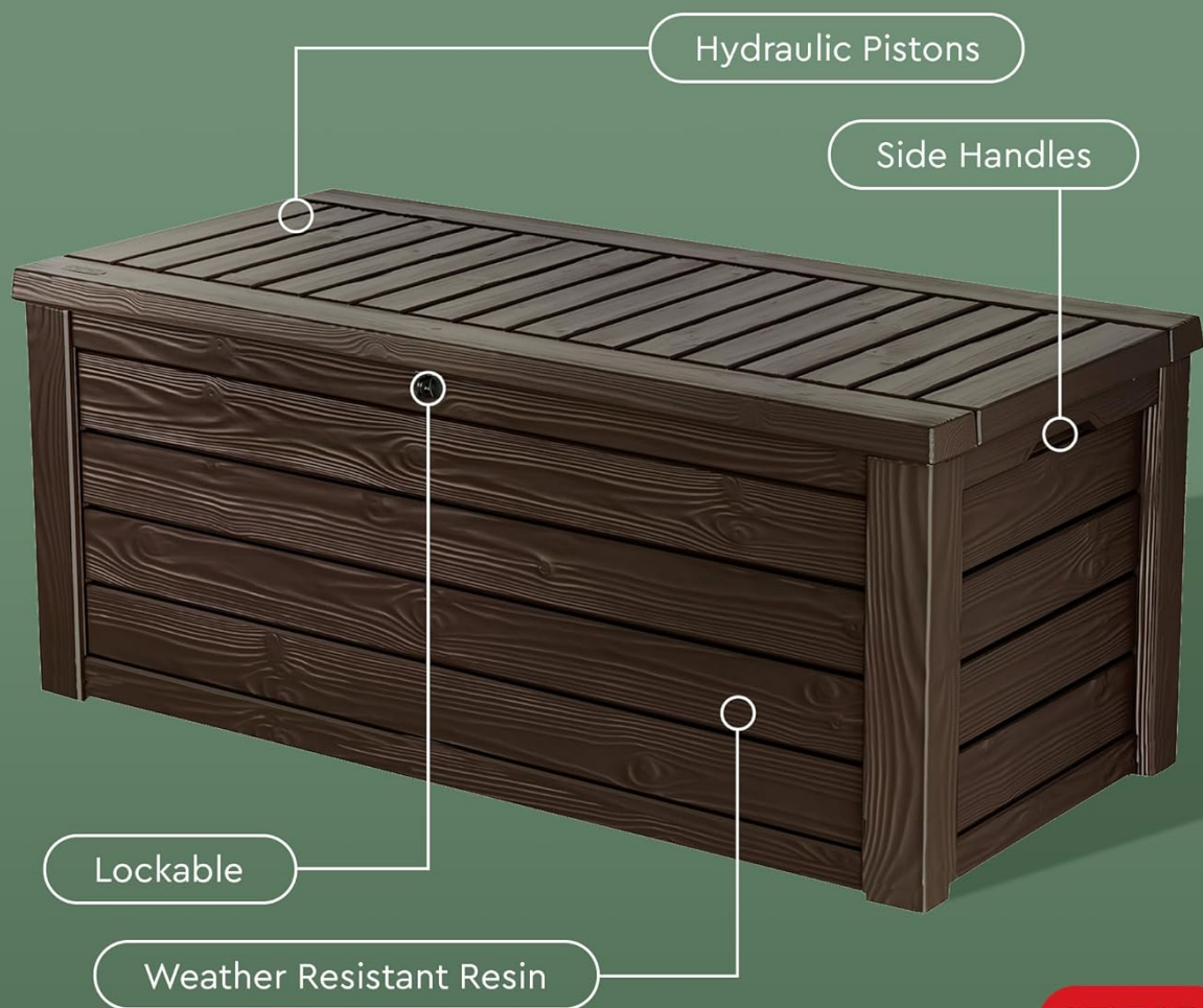
Figure 2: Diagram illustrating the hydraulic pistons, side handles, lockable feature, and weather-resistant resin construction.