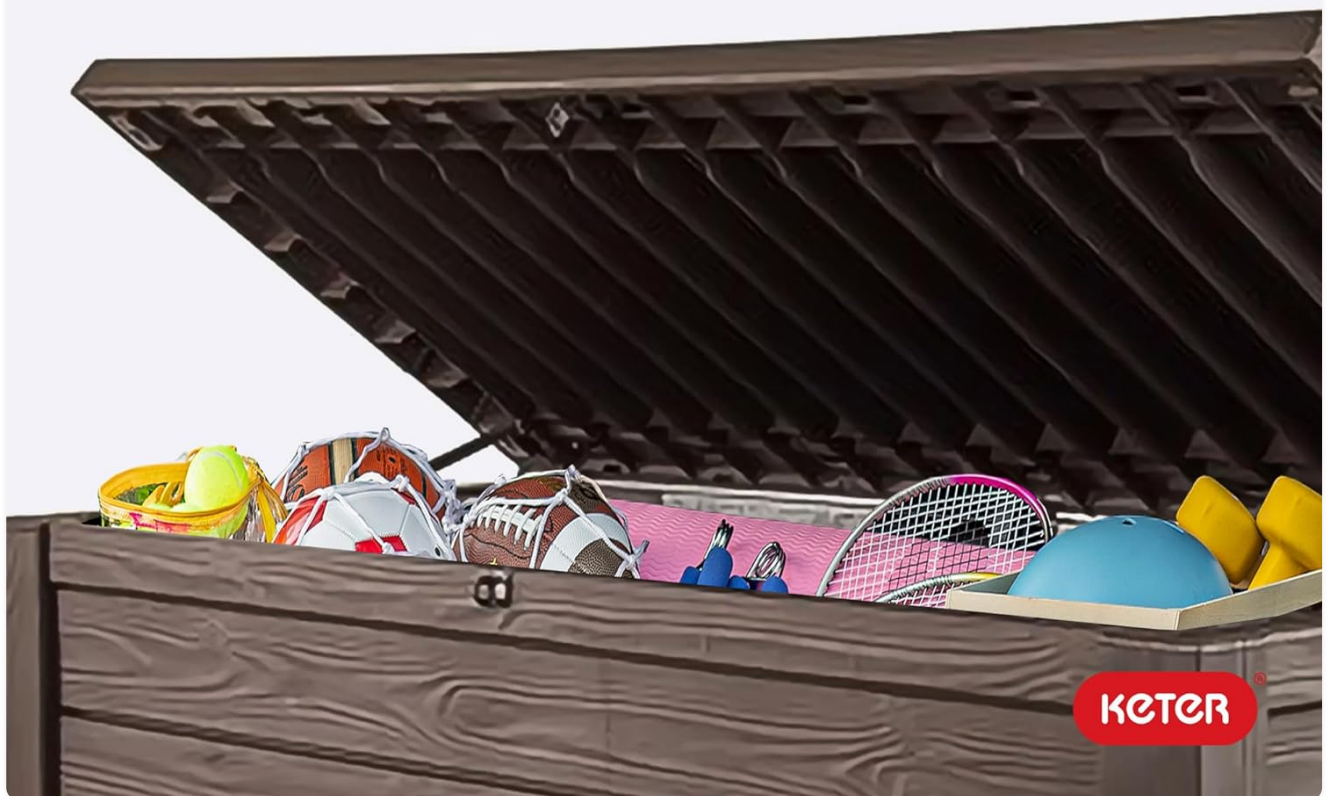
Figure 5: The Keter Westwood Deck Box demonstrating its versatile storage capabilities for patio cushions, sports equipment, garden tools, and pool supplies.