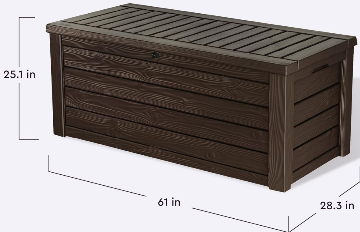
Figure 4: The Keter 150 Gallon Deck Box with key dimensions (length, width, height) and weight capacity labeled.