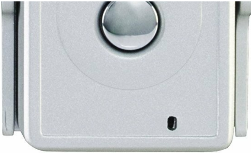
Figure 4.1: Front view of the Wipro iview outdoor unit. This image shows the camera lens, speaker grille, call button, and Wipro branding.