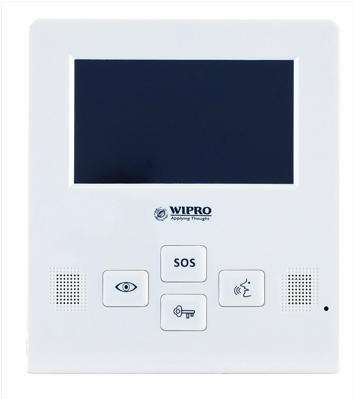
Figure 4.3: Front view of the Wipro iview indoor monitor. This image displays the 4.3-inch screen, speaker grilles, and control buttons including SOS, view, talk, and unlock.