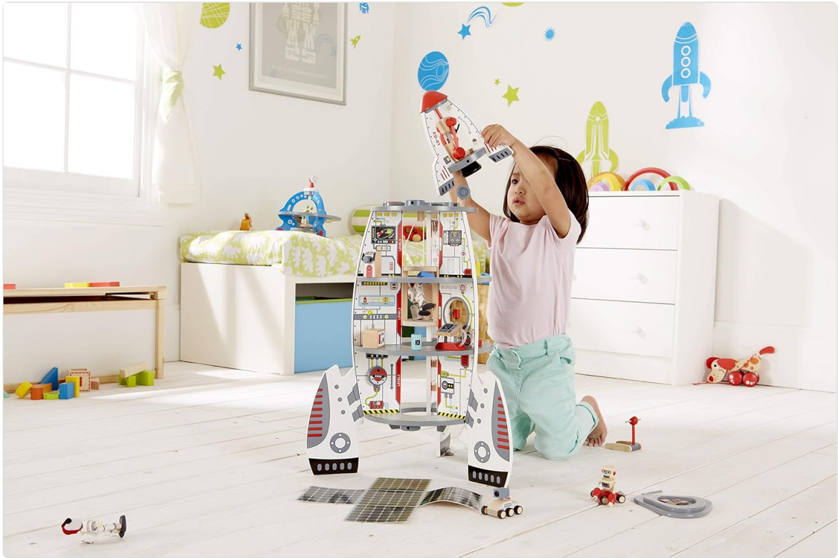
Image: A child interacting with the assembled rocket ship, demonstrating its scale and play potential with figures and accessories.

rooms, living quarters, and laboratories.