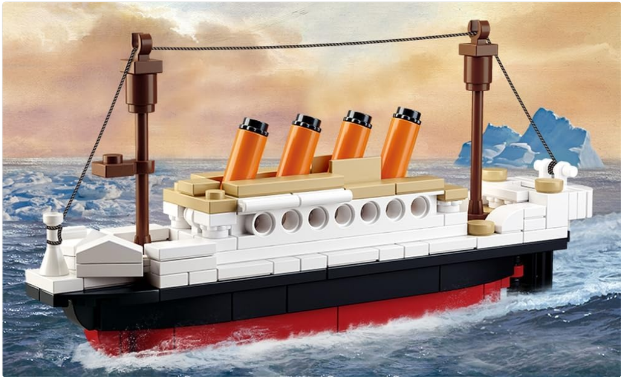
This image displays the fully assembled Sluban M38-B0576 Titanic Building Bricks Set, showcasing the ship's design with its white superstructure, black hull, red bottom, and four orange funnels, set against a backdrop of an ocean and iceberg.