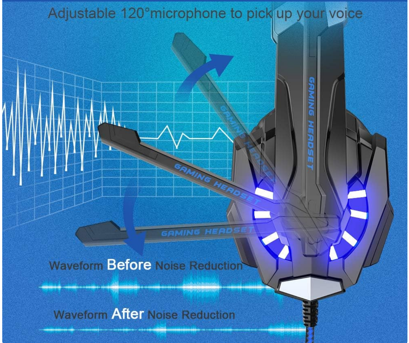
Image: Illustration of the adjustable 120° microphone, demonstrating its flexibility and noise reduction capabilities for clear voice transmission.

Adjustable 120° microphone to pick up your voice