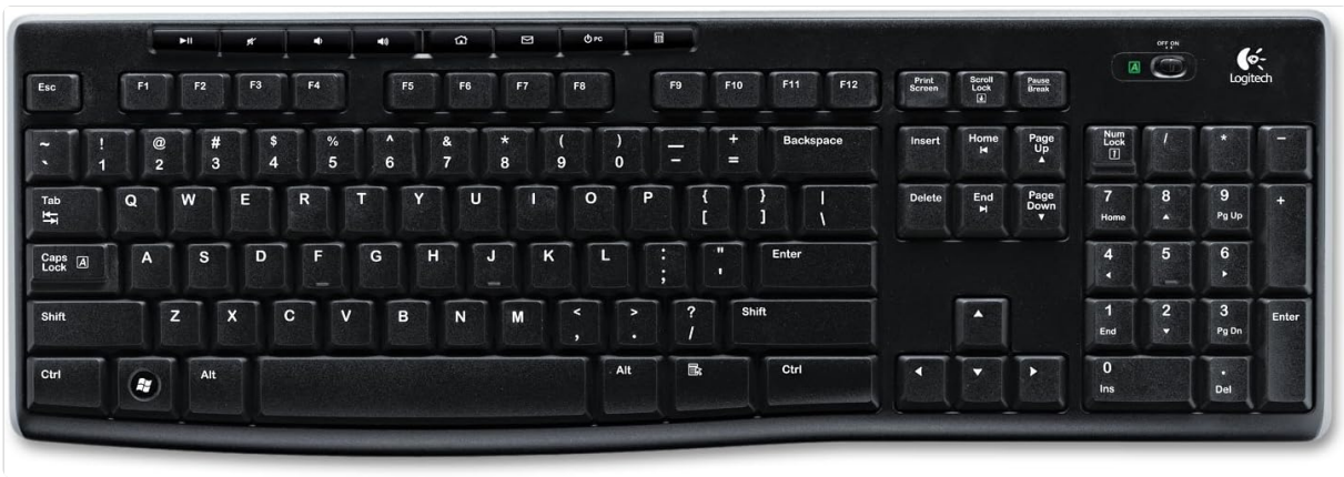
Image: Top-down view of the Logitech K270 Wireless Keyboard, showing the full layout including the numeric pad and function keys.