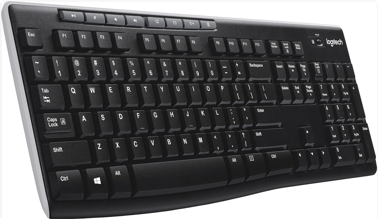
Image: Angled view of the Logitech K270 Wireless Keyboard, showcasing the right side with the numeric keypad and hotkeys.

The included Unifying receiver allows you to connect up to five additional compatible Logitech wireless devices (such as mice or other keyboards) to the same receiver, freeing up USB ports. Use the Logitech Unifying Software to manage and pair additional devices.