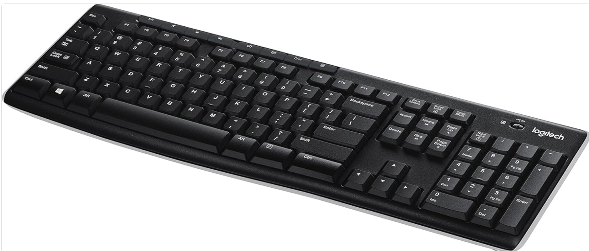
Image: Angled view of the Logitech K270 Wireless Keyboard, highlighting its slim profile and key arrangement.