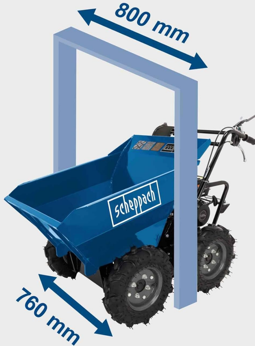
Compact design with a width of 760 mm for easy access to narrow spaces.

Dank der geringen Durchfahrtsbreite von 760 mm sind auch schwer zugängliche Stellen problemlos erreichbar.