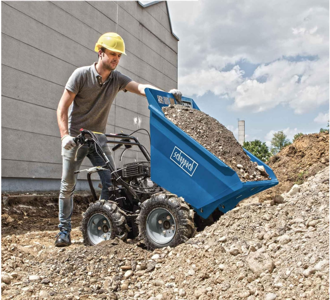
The Scheppach DP3000 Dumper is suitable for transporting loose and solid materials.

Der Dumper 3000 ist ideal für lose und feste Transportgüter geeignet.