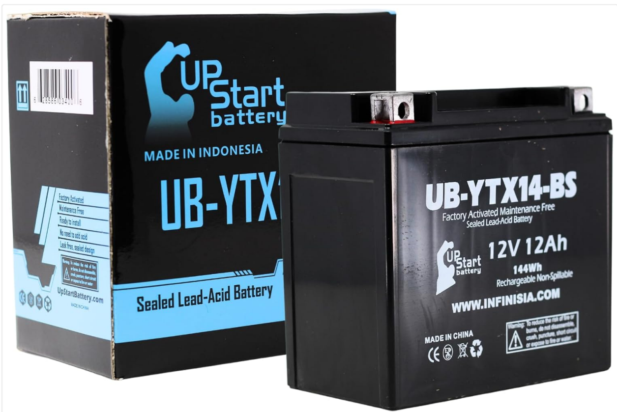
Image 1.1: The Upstart Battery UB-YTX14-BS battery shown with its retail packaging.

This manual provides essential information for the safe and effective use of your Upstart Battery UB-YTX14-BS sealed lead-acid ATV battery. Please read these instructions carefully before installation and operation.