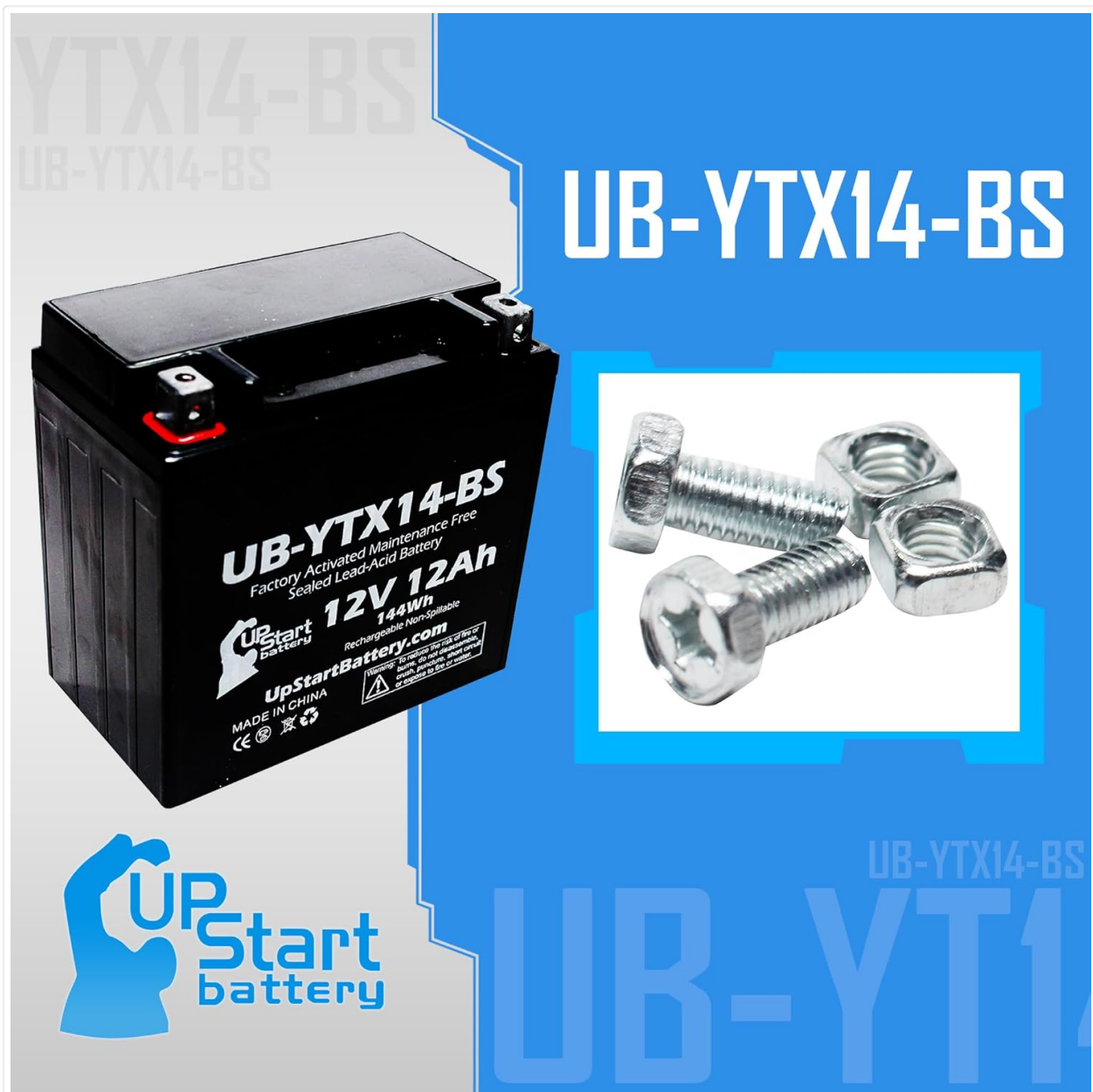
Image 3.1: Example of terminal bolts and nuts used for securing battery cable connections.