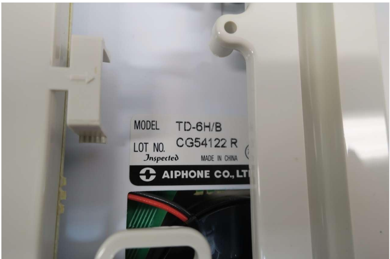
Figure 4: Model label for the Aiphone TD-6H/B. This image provides a clear view of the product's identification label, which states 'MODEL TD-6H/B', 'LOT NO. CG54122 R', 'Inspected', and 'MADE IN CHINA'. The Aiphone Co., Ltd. logo is also visible.