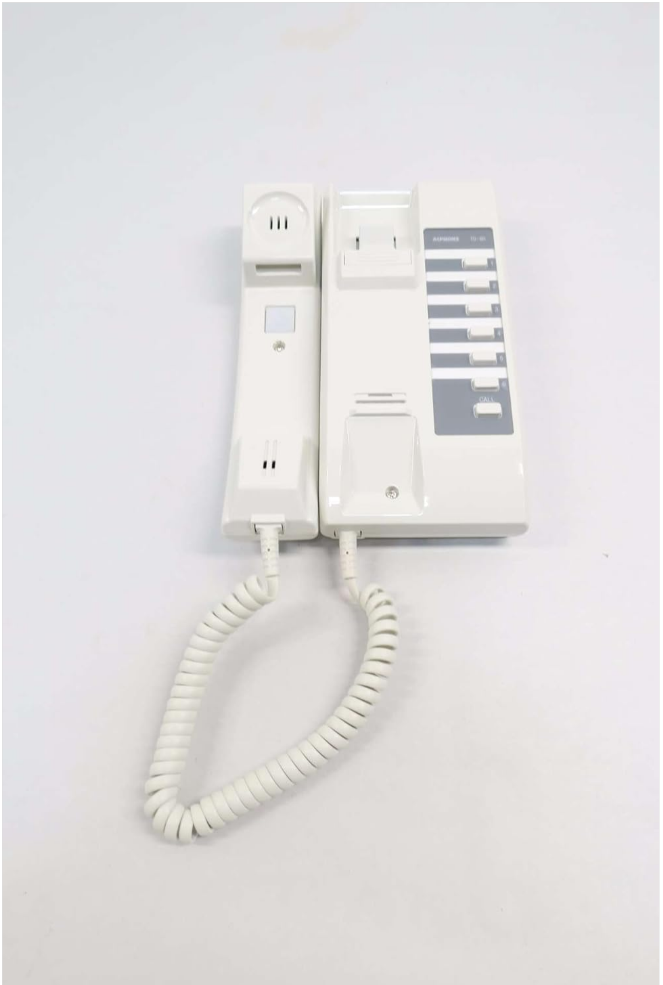
Figure 2: Side view of the Aiphone TD-6H/B handset. This image provides a perspective of the intercom unit from the side,