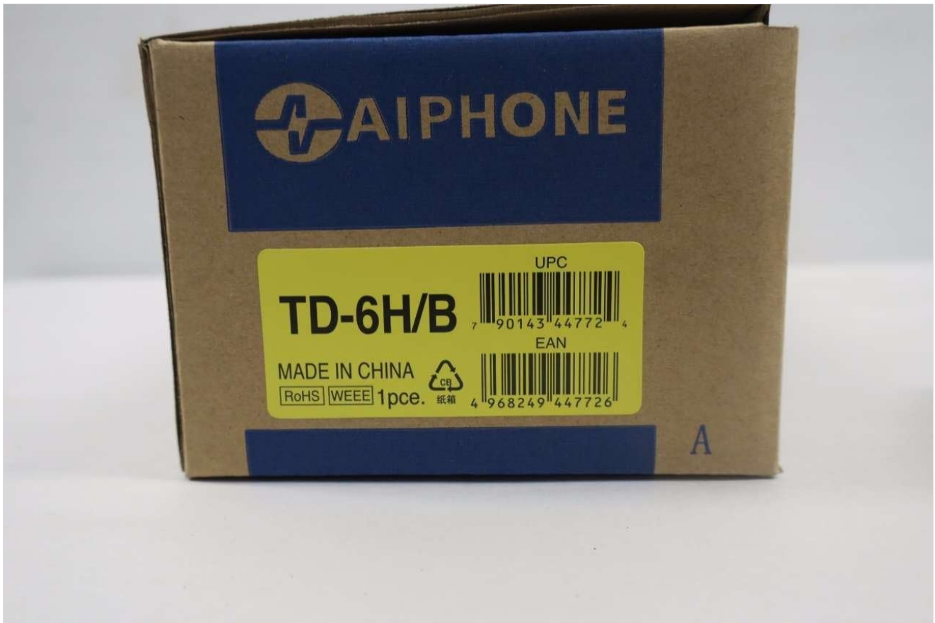
Figure 5: Packaging for the Aiphone TD-6H/B. This image shows the product's retail packaging, prominently displaying 'TD-6H/B', 'MADE IN CHINA', and various compliance logos (RoHS, WEEE). Both the UPC (0790143447724) and EAN (4968249447726) barcodes are clearly visible.