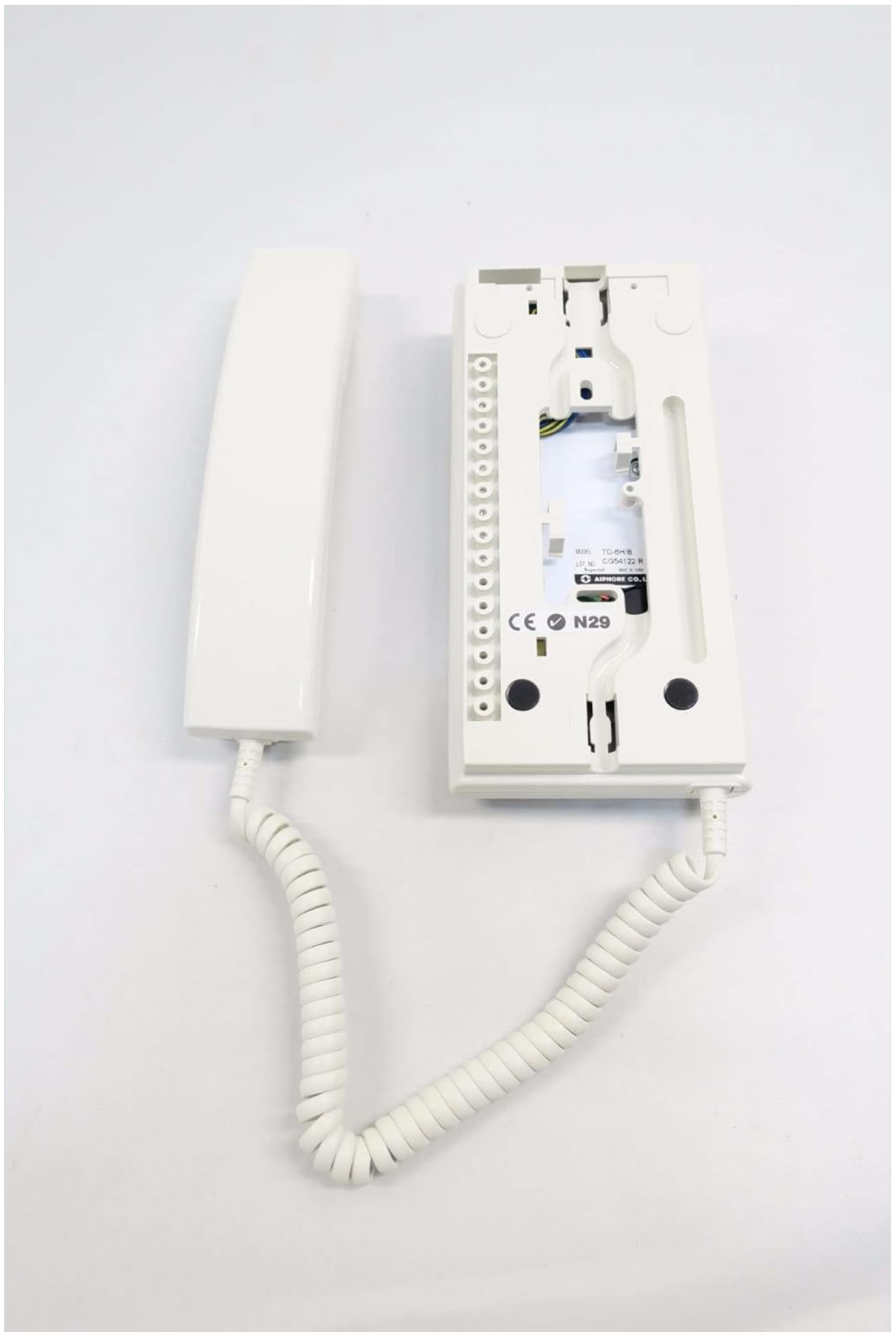
Figure 3: Rear view of the Aiphone TD-6H/B Intercom base. This image shows the back panel of the intercom unit, revealing the terminal block for wiring connections. The internal circuitry and mounting points are also visible, along with a label indicating 'MODEL