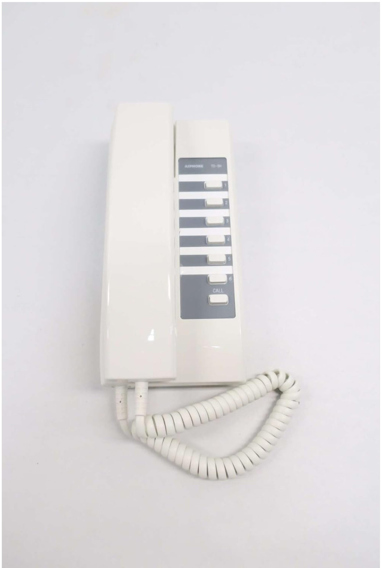
Figure 1: Front view of the Aiphone TD-6H/B handset. This image displays the main body of the intercom unit, including the handset receiver, the base with multiple numbered call buttons (1-6), and a 'CALL' button. The Aiphone logo and 'TD-6H' model designation