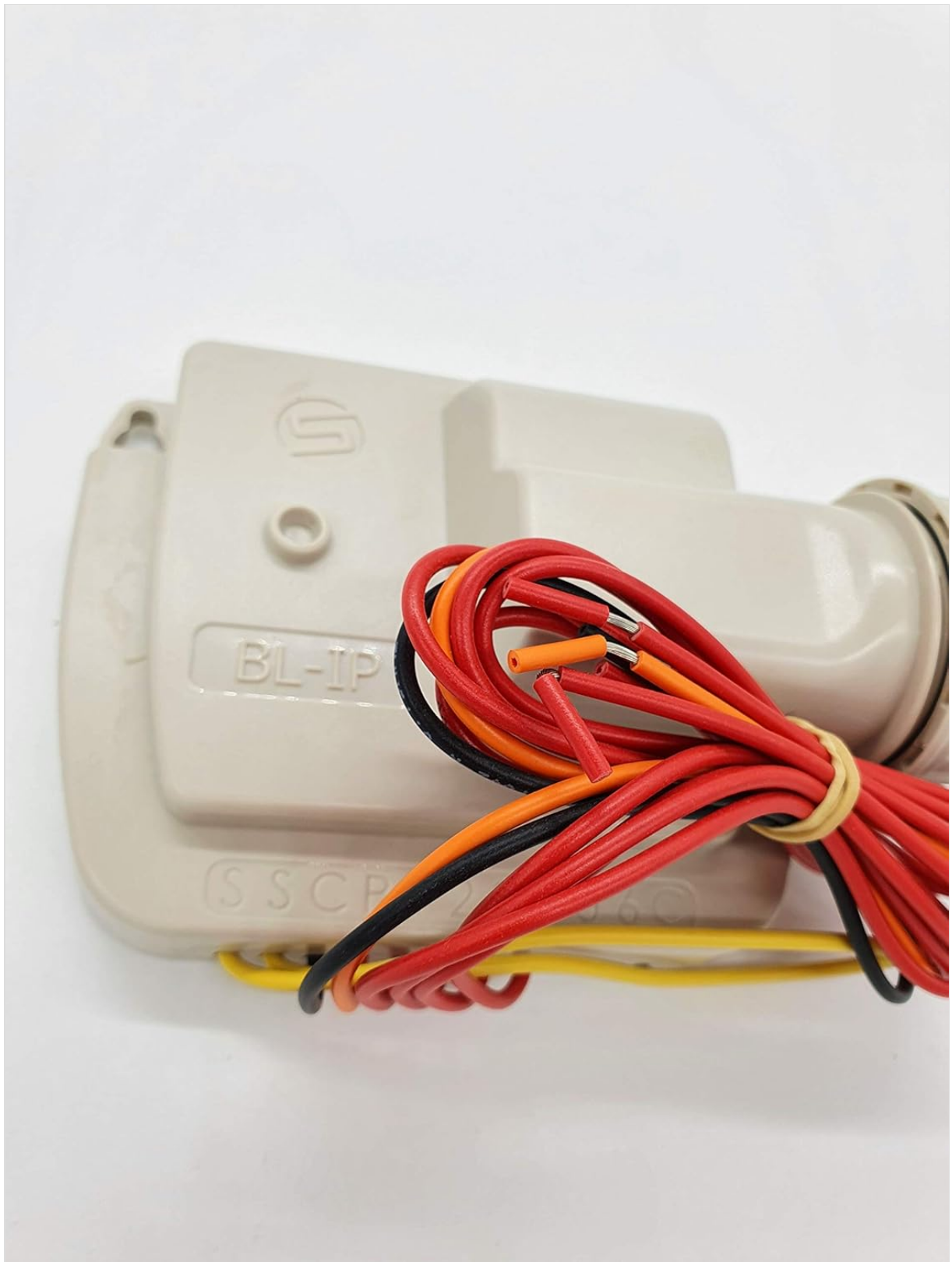
Image: The SOLEM BL-IP4 irrigation programmer showing its compact design and pre-wired connections for easy installation into an existing irrigation system.