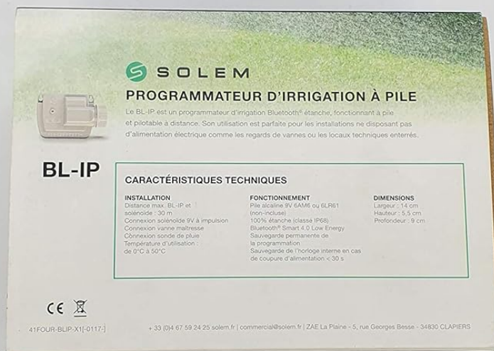
Image: A technical data sheet for the SOLEM BL-IP series, detailing installation, functionality, and dimensions.