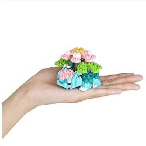
Image: Nanoblock Pokémon in hand. This image illustrates the miniature scale of a completed nanoblock Pokémon model, fitting in the palm of a hand.