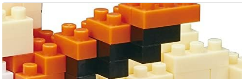
Image: Close-up of nanoblock pieces. This image shows the small size and variety of nanoblock pieces, including orange, black, and white blocks.