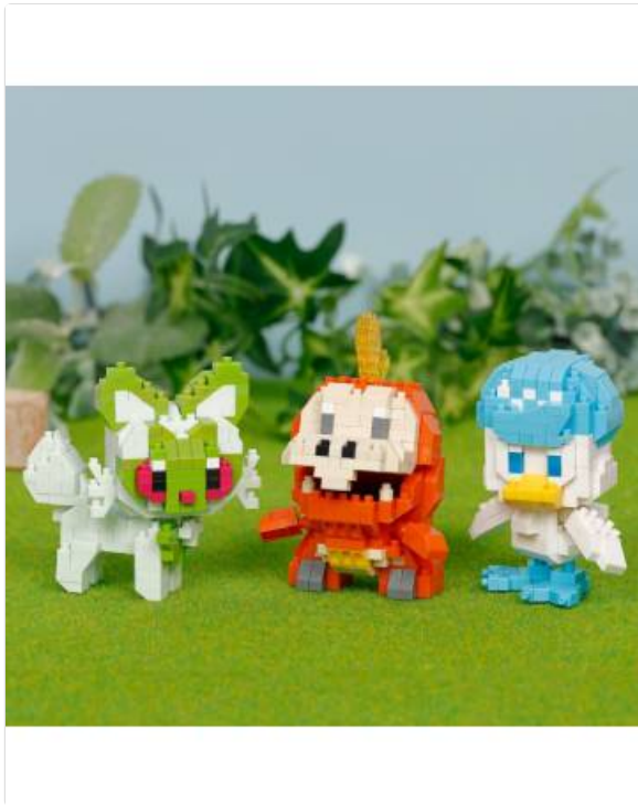
Image: Collection of nanoblock Pokémon. This image shows various nanoblock Pokémon models displayed together, illustrating how they can be collected and exhibited.