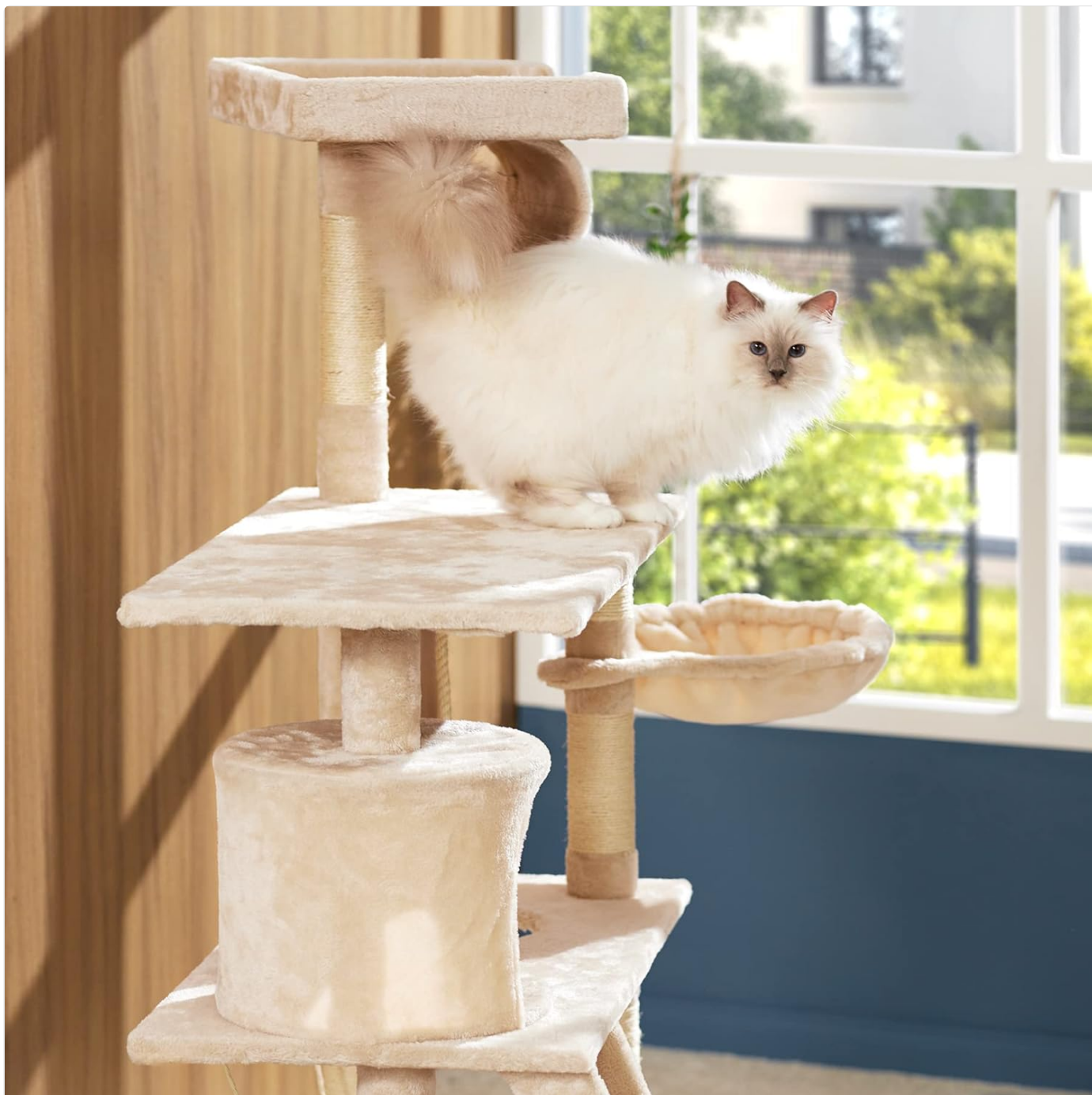
A cat comfortably positioned on the high viewing platform, demonstrating a resting spot.