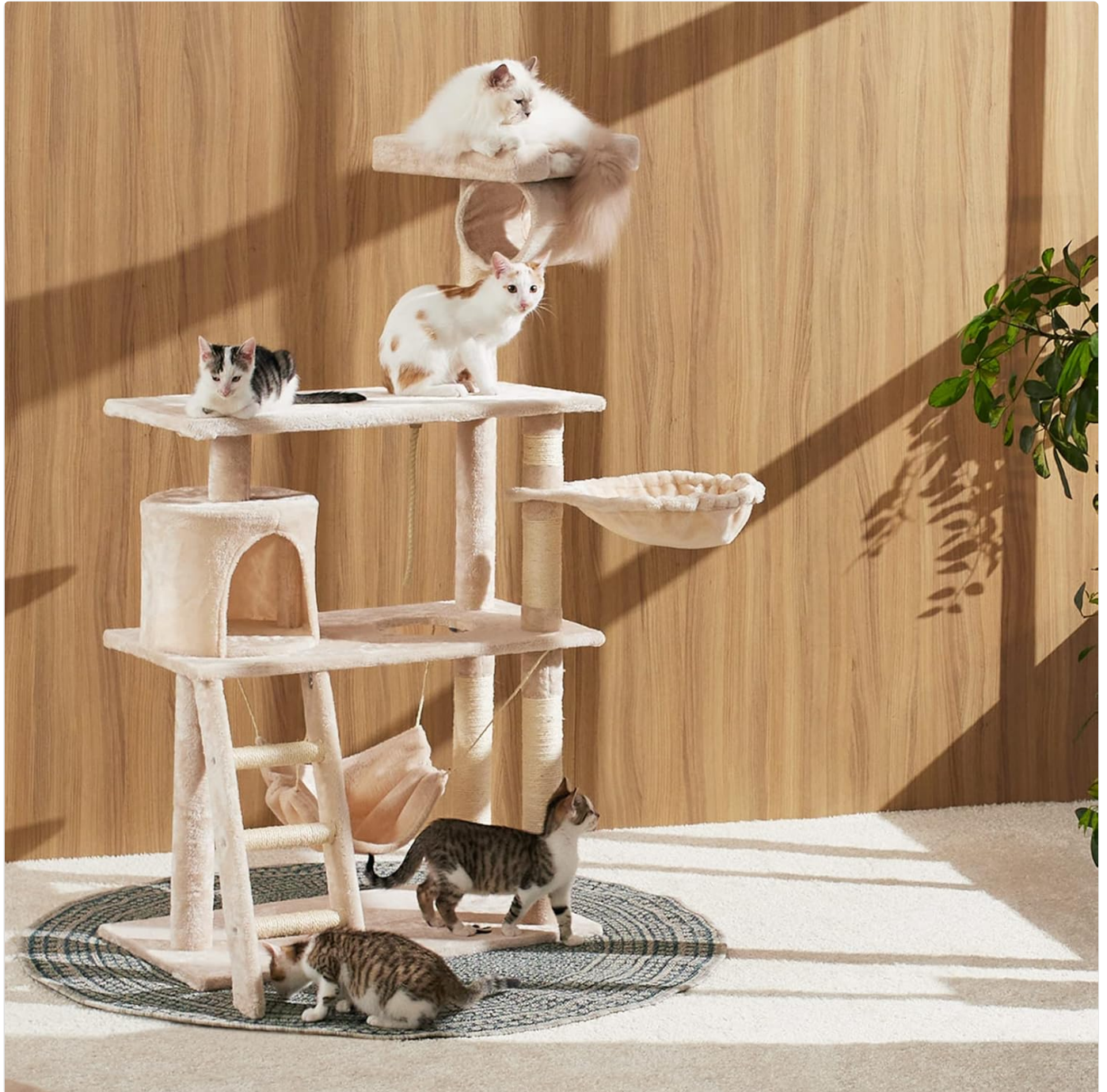
Cats enjoying the multi-level design, scratching posts, and various play areas of the Tectake Cat Tree.

Encourage your cat to use the tree by placing treats or toys on different levels. Some cats may need time to adjust to a new structure.