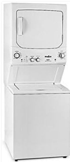
Image 1: Mabe MCL1740ESBB0 Washer Dryer Combo. This image displays the Mabe MCL1740ESBB0 Washer Dryer Combo, a white stacked unit with the dryer on top and the washer below. The control panel is located between the two units.

The Mabe MCL1740ESBB0 is a combined washer and dryer unit designed for efficient laundry processing. This stacked appliance offers both washing and drying capabilities in a single compact footprint, optimizing space and time.