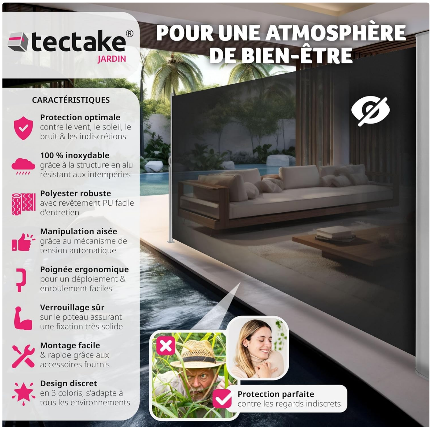
Image: The TecTake Retractable Side Awning fully extended, providing privacy and shade on a patio.