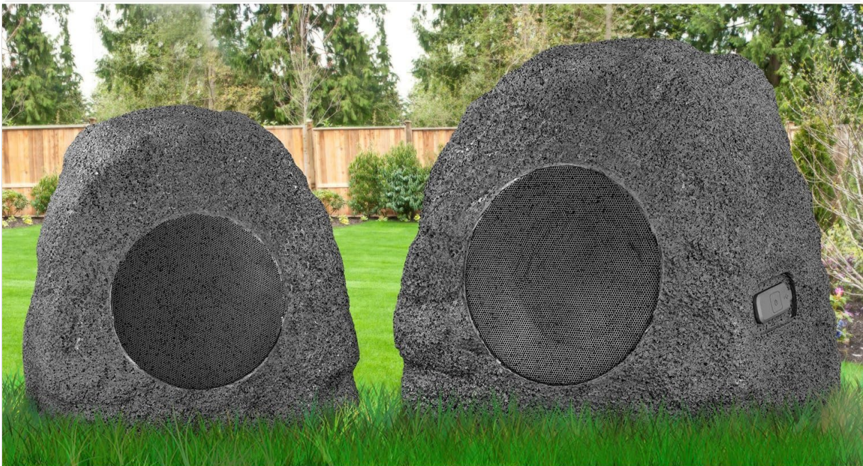
Figure 2: ITSBO-358P5 rock speakers integrated into an outdoor landscape.