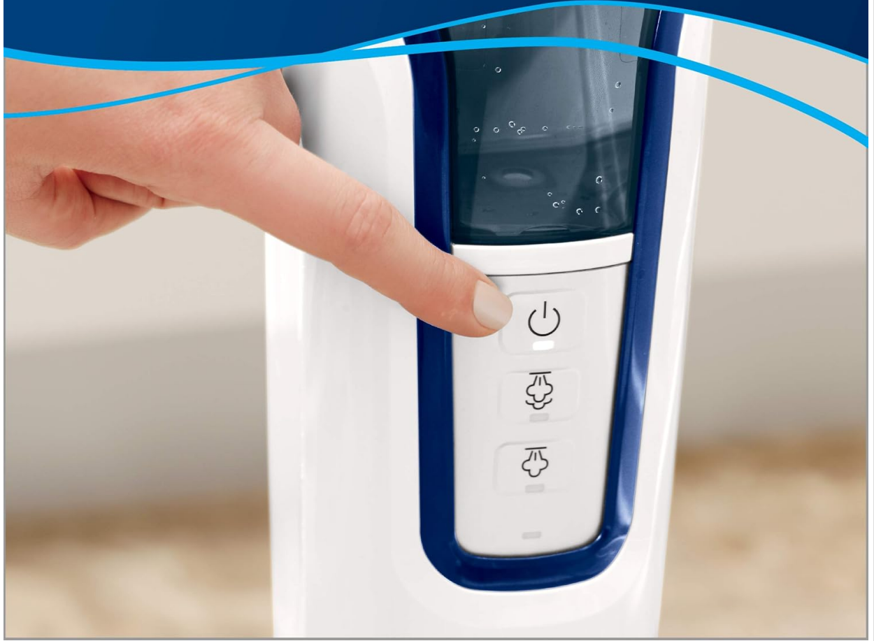
Image: Digital steam control panel with power button and steam level selection buttons.