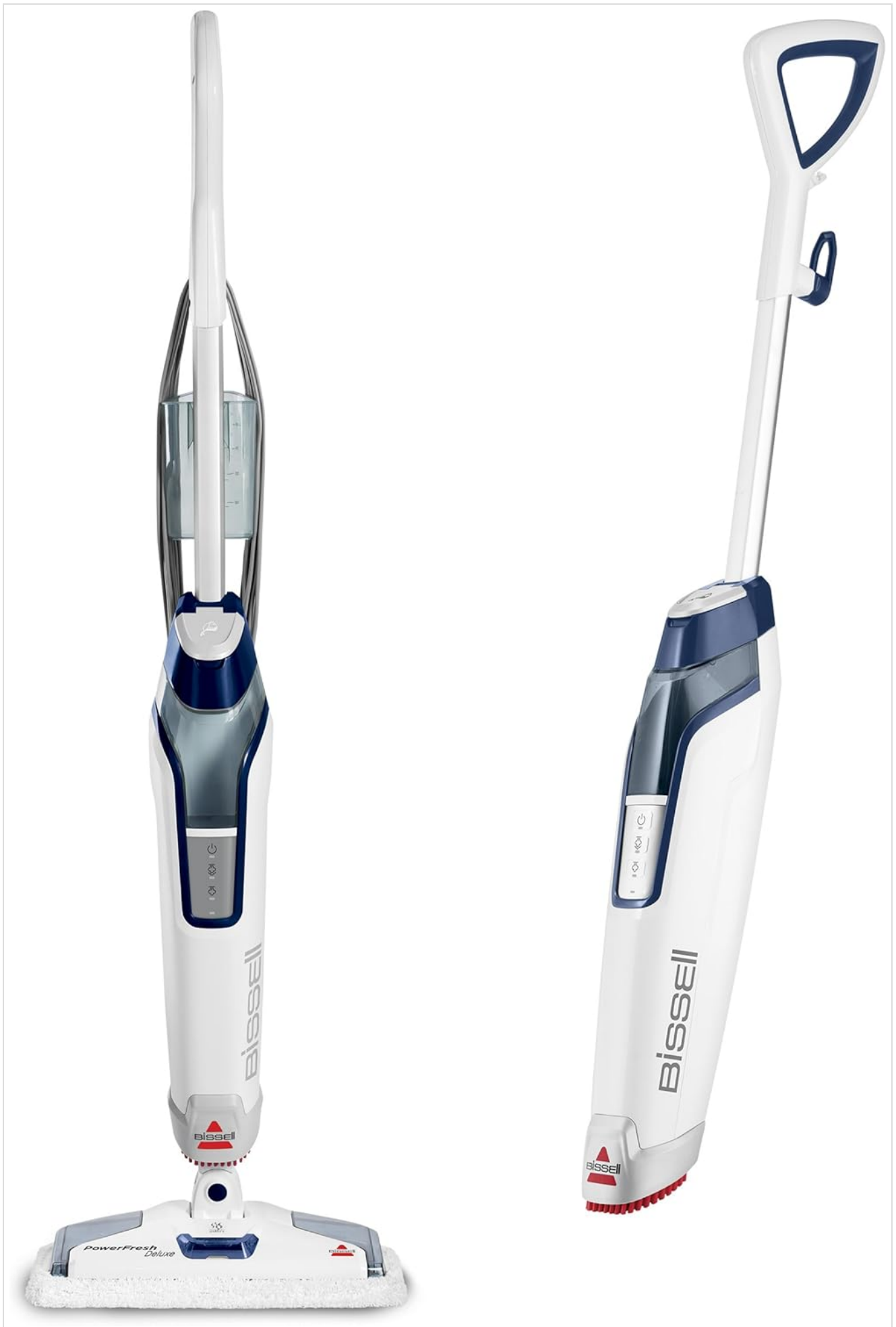
Image: Front and side view of the BISSELL PowerFresh Deluxe Steam Mop, showcasing its upright design and detachable handheld unit.