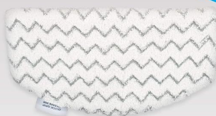
1 SCRUBBY PAD