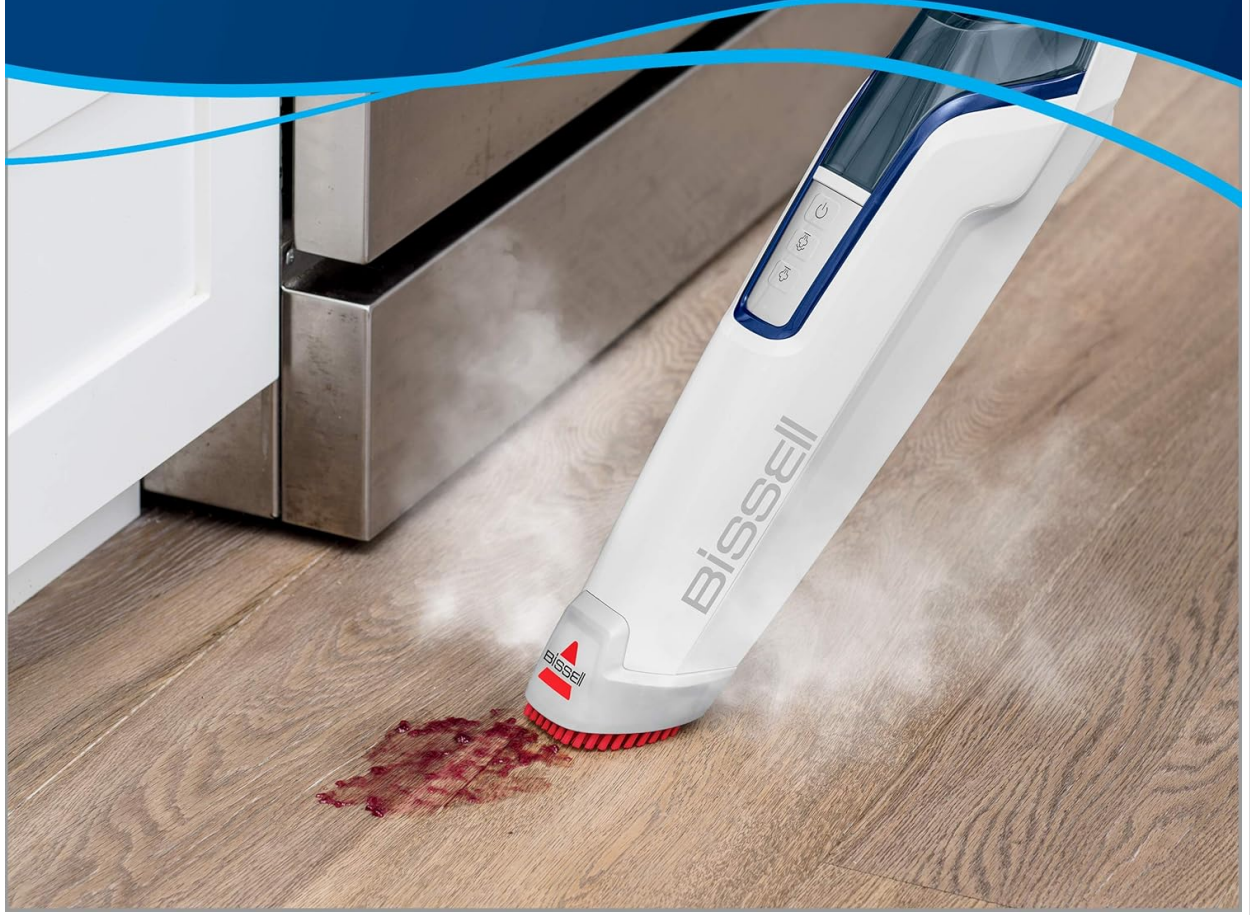
Image: The detachable SpotBoost Brush being used to clean a sticky mess on a hard floor, demonstrating its targeted cleaning capability.