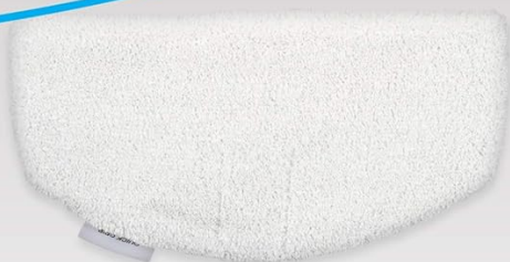
1 SOFT PAD