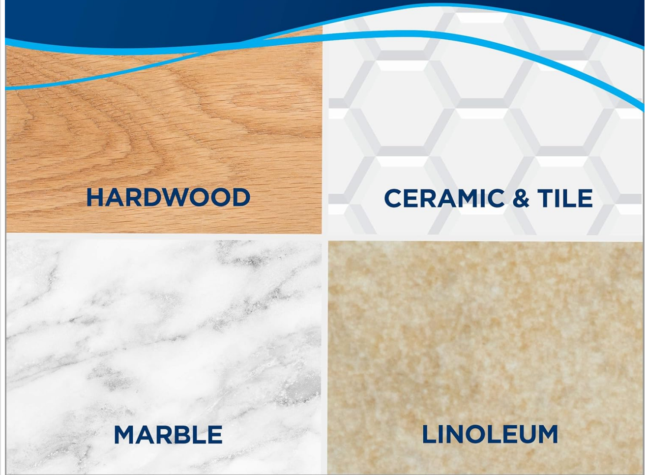
Image: Visual guide indicating safe surfaces for steam mop use, including hardwood, ceramic & tile, marble, and linoleum.