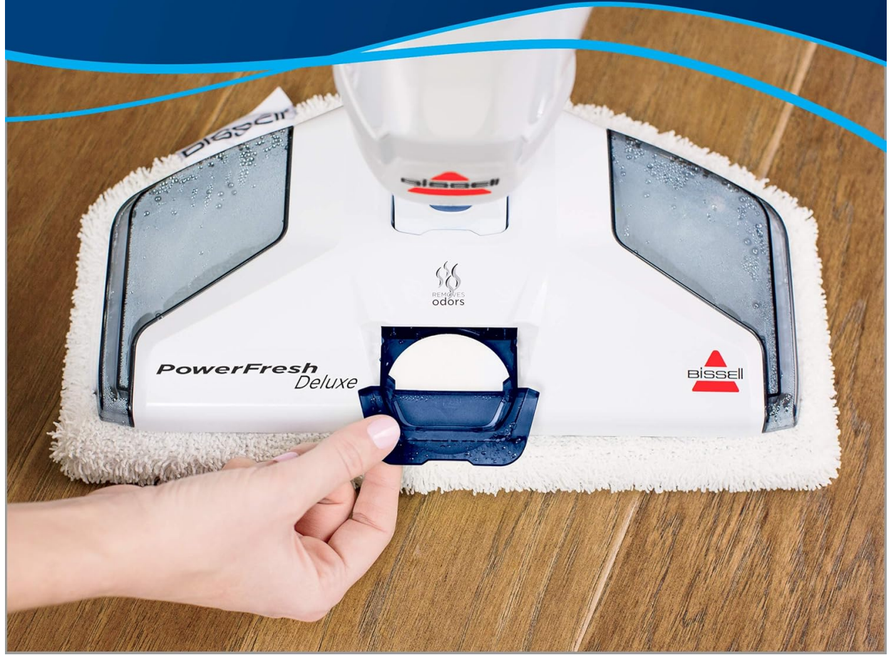
Image: A hand demonstrating how to open the built-in scent disc tray on the mop head.